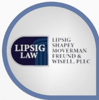
LIPSIG, SHAPEY, MOVERMAN, FREUND & WISELL, PLLC PLATINUM SPONSOR