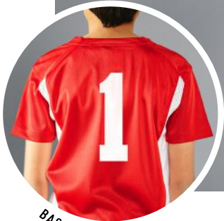
BACK PRINT DESIGN