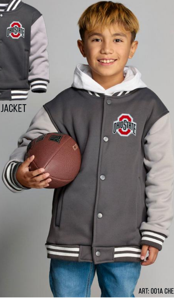
ART: 001A CHENILLE PATCH