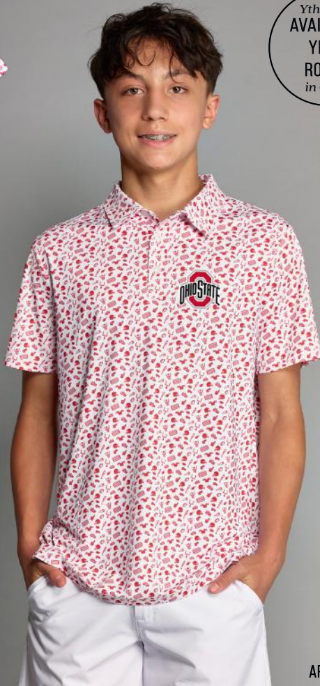
ART: 001A EMB