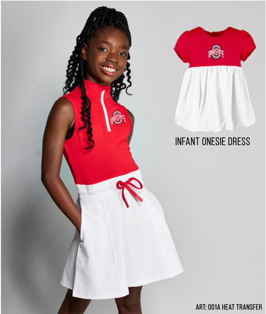
INFANT ONESIE DRESS