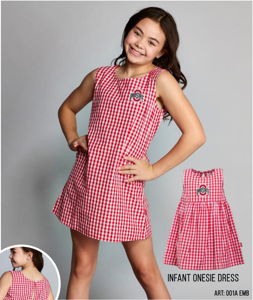
INFANT ONESIE DRESS