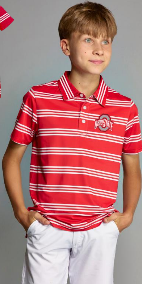
ART: 001A EMB