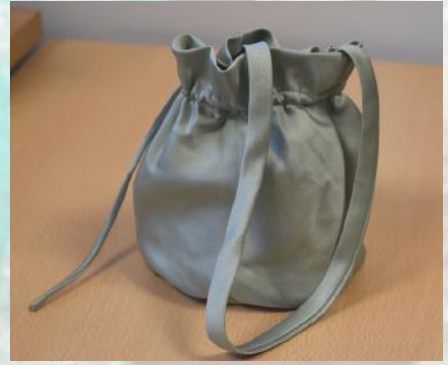
Silk Pouch Bag comes with the Sage Green Dress to the left