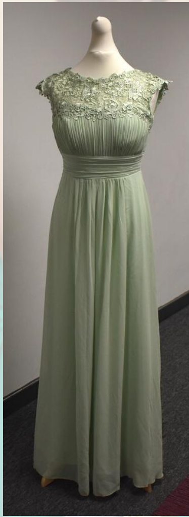
Sage Green Laced Shoulder Dress (Pouch Bag to the right included) Size 10