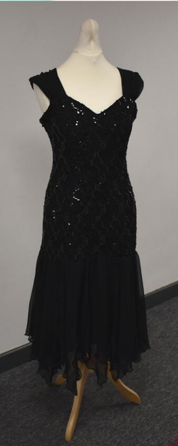
Black Heart-Shaped Neckline Dress with Sequin Detailing and Gathered Chiffon Hem Size 14