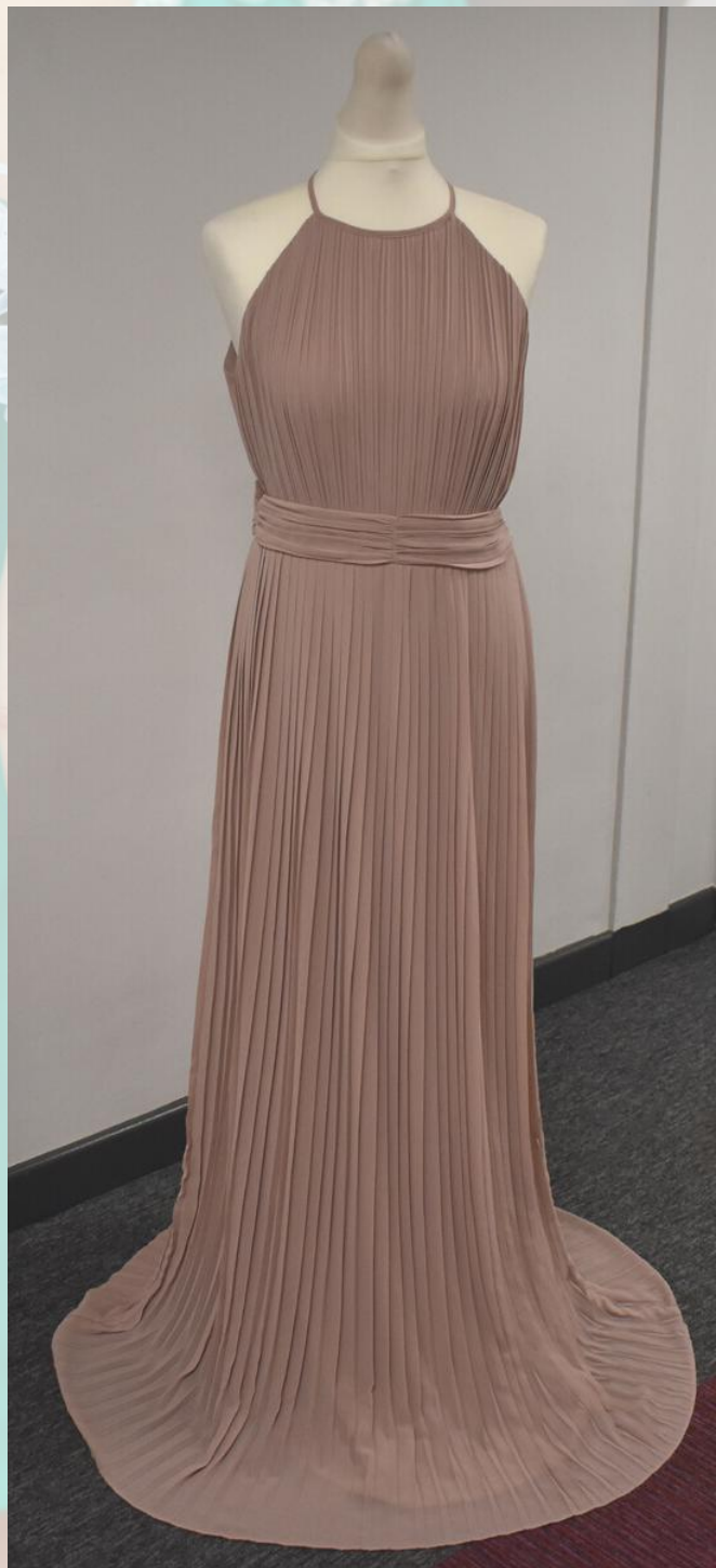
Long Halter-Neck Pink Pleated Dress Size 16