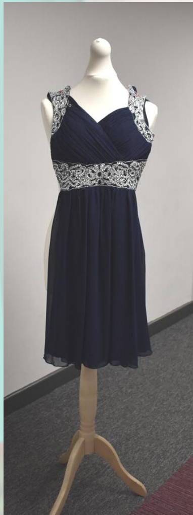
Royal Blue Silver Sequin above the knee Dress Size 8