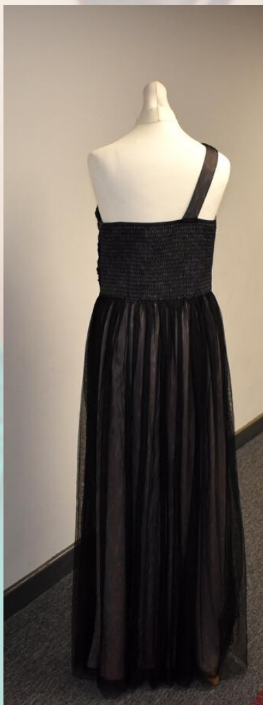
Mauve with Black Overlay One-Shoulder Dress (back)