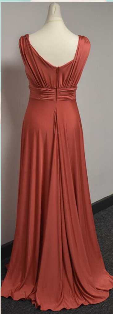
Coral V-Neck Ruched Dress (back)

Slim Fit Dark Blue Three-Piece Suit with Shirt and Tie (three images below) Trousers: 30R (76cm) Waistcoat: 38R (96.5cm) Jacket: 38S (96.5cm) Shirt: 15" Collar