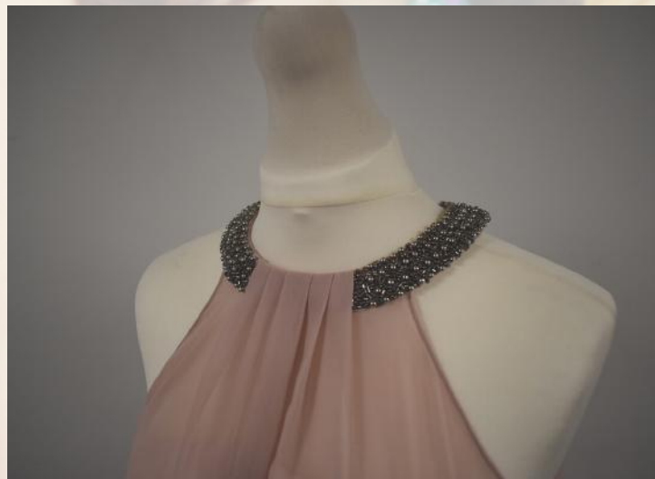
Long Halter-Neck Blush Pink Dress with Satin Tie Up Waist Belt (at the back) and Beaded Neckline Size 8