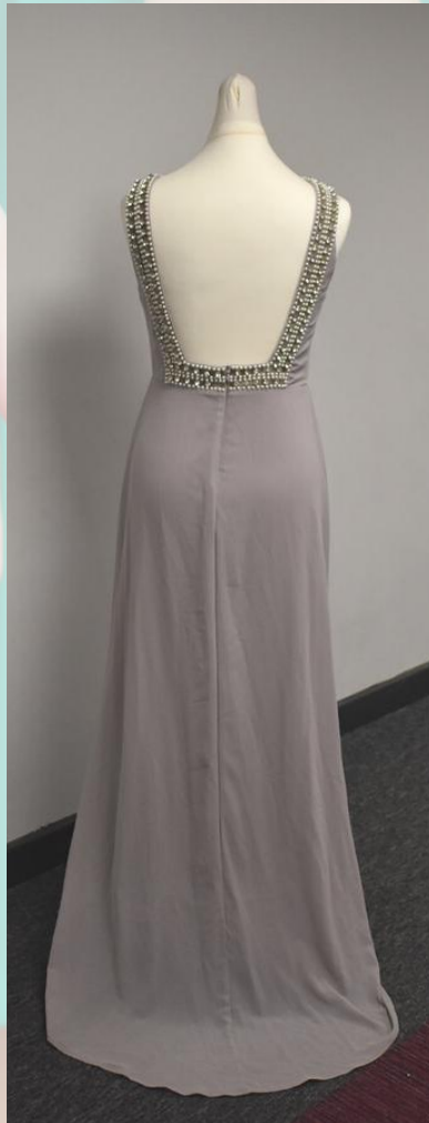
Lilac High Neck Backless Dress with Sequin and Pearl Detail (back)