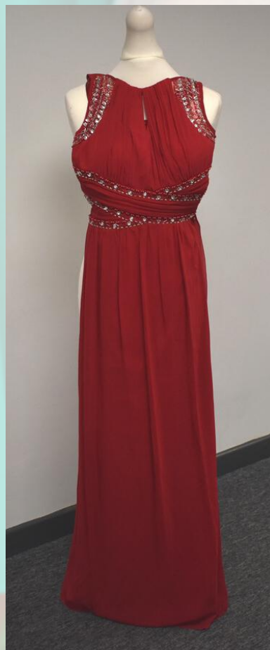
Red Keyhole Front Dress with Criss-Cross Sequin Band Detail Size 10