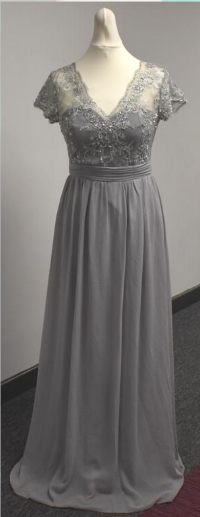
Silver Floral Beaded Dress (front) Size 10