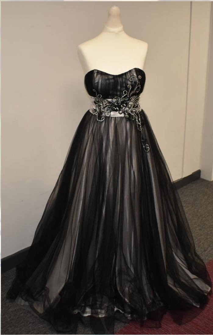
Black and White Full Strapless Dress with Jewel Detail Size 6