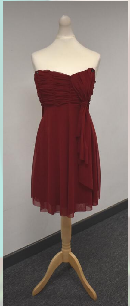
Red Strapless, Ruched above the knee Dress Size 8