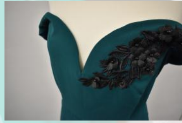
Dark Green, Off The Shoulder Fishtail Dress with Heart-Shaped Neckline and flower/Lace Black Detailing Size 18