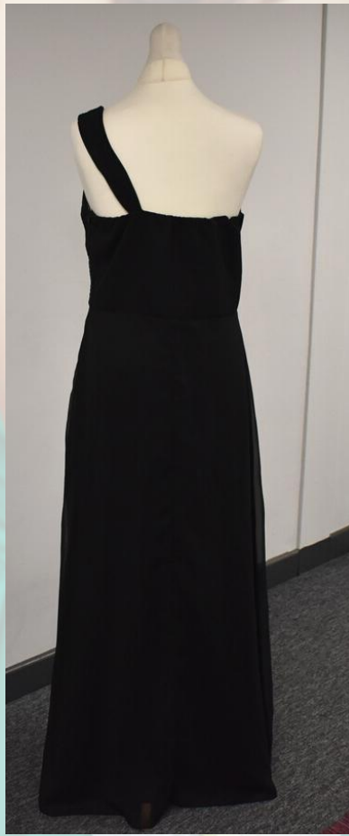
Black One Strap Crystal Detail Dress (back)