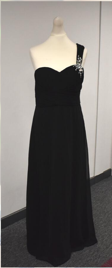
Black One Strap Crystal Detail Dress (front) Size 16