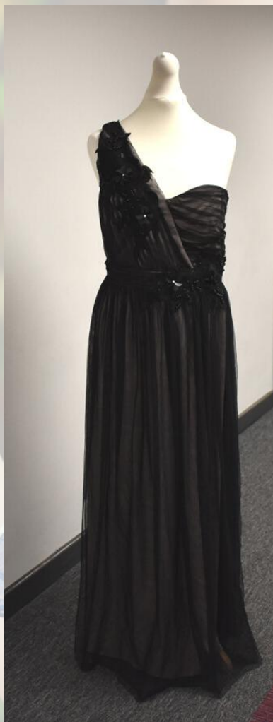
Mauve with Black Overlay One-Shoulder Dress (front) Size 18