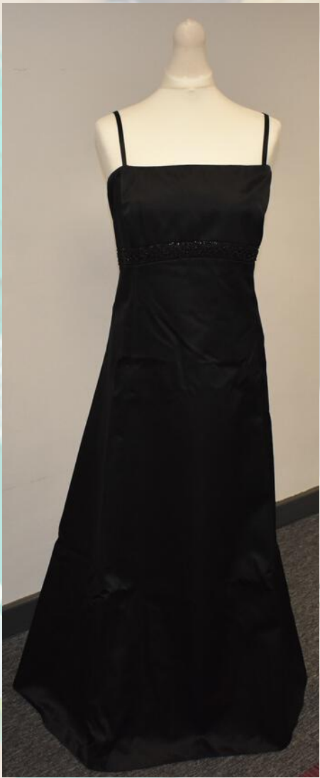
Black Empire Line Strapless Dress with Detachable Straps and Sequin Detail. Size 20