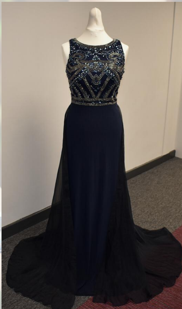
Navy Blue Embellished Dress with Train (front) Size 8/10