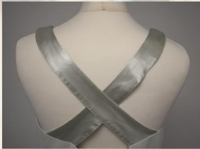
Long Pale Green Dress with Pleated Bodice and Jewelled Detailing and Satin Criss-Cross Straps Size 14