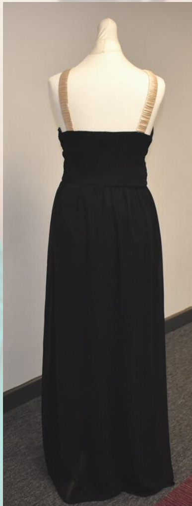
Black and Gold Chiffon Dress with Keyhole Front (back)