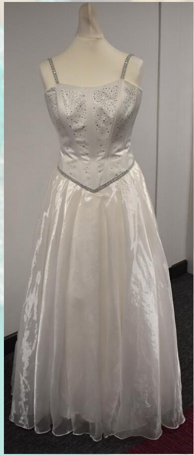
White Princess Dress with Corset Top Diamante Detail Size 10