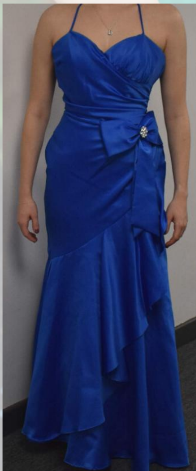
Blue Satin Boned Dress with Bow Detail and Criss/Cross Straps at the back Size 6/8