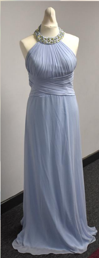
Light Blue Beaded Halter Neck Dress Size 10