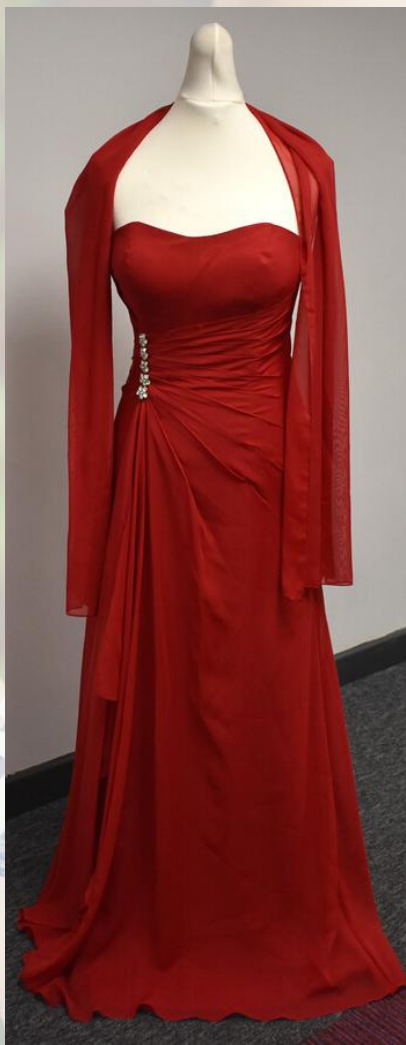
Red Removable Straps Corset Dress with Back Gathered Waist (front) Size 8/10