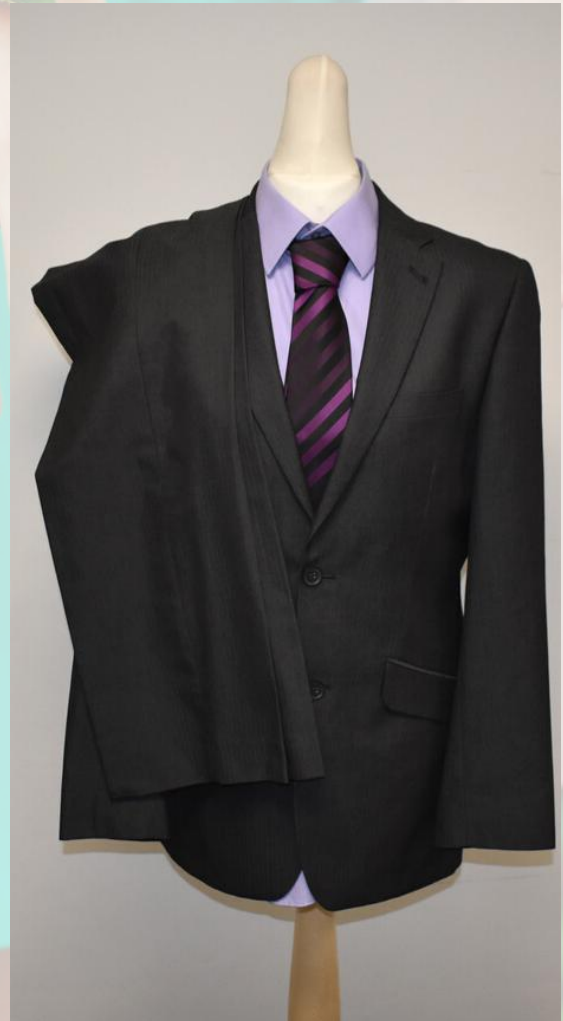
Grey Pinstriped Two-Piece Suit with Shirt and Tie Trousers: 30cm Waist and 31cm Length Jacket: 36R Shirt: 15.5" Collar