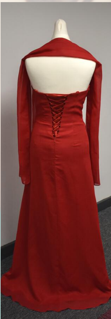
Red Removable Straps Corset Dress with Back Gathered Waist (back)