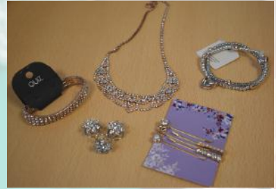
Assortment of Jewellery and Hair Accessories