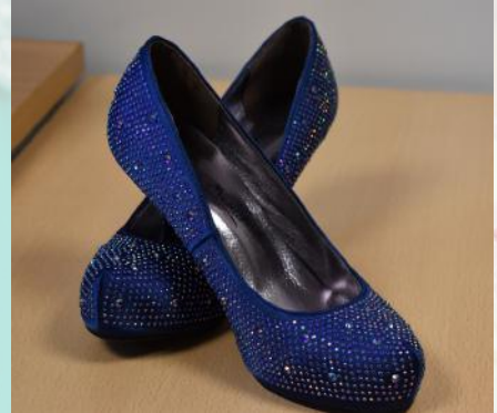
Dark Blue Crystal Court Shoes: Size 4