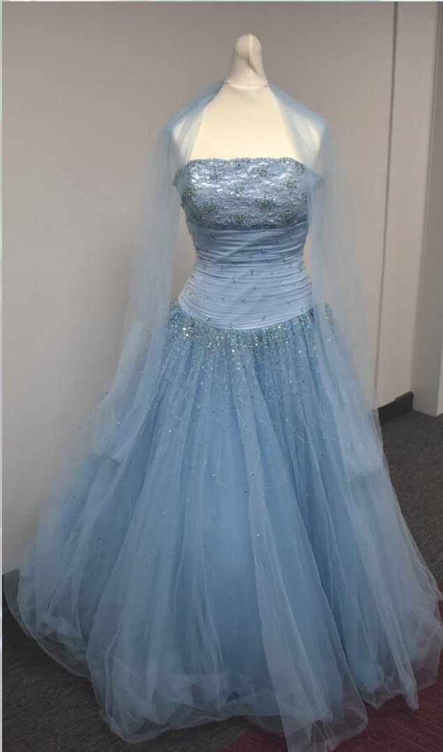
Sky Blue Full Princess Dress with Sequined Bodice and Skirt Size 8