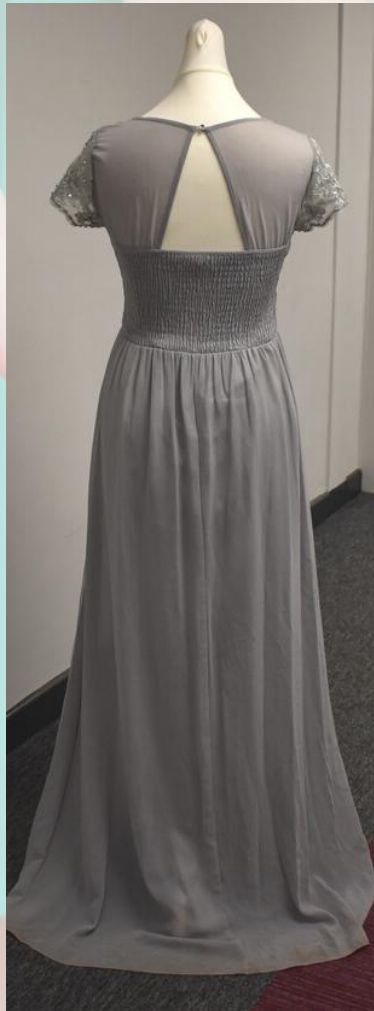
Silver Floral Beaded Dress (back)