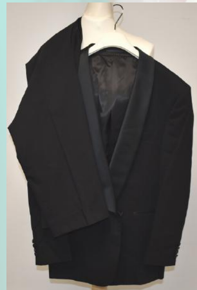
Black Tuxedo Satin Lapel Two-Piece Suit Jacket: Size not stated Trousers: 38S