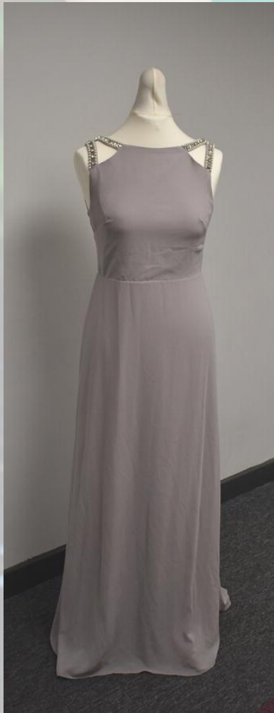
Lilac High Neck Backless Dress with Sequin and Pearl Detail (front) Size 12