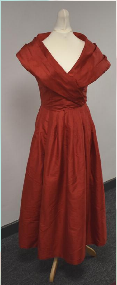
Red Laura Ashley Vintage Styled Ankle-Length Dress Size 10