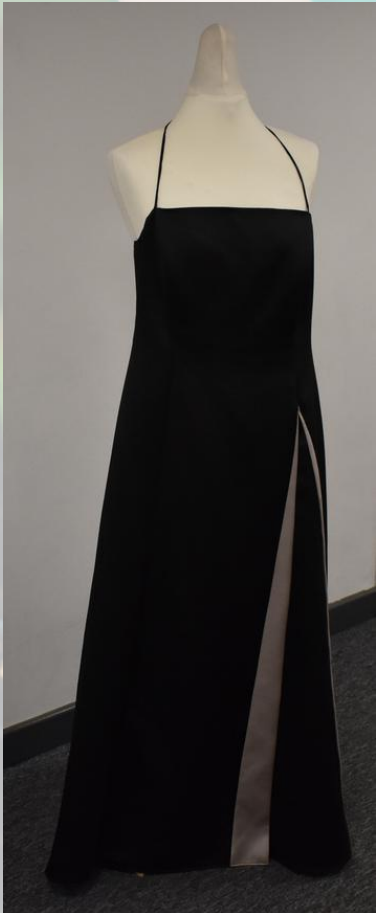
Black Laura Ashley Halter Neck Dress with Silver/Purple Detail Size 16