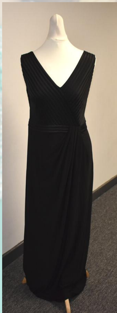
Black V-Neck Dress Size 16