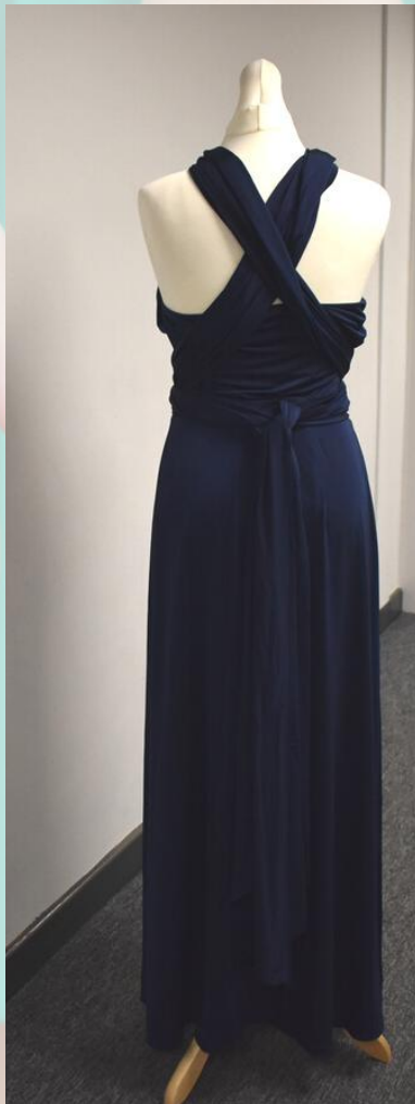
Navy Blue Multiway Dress (back)