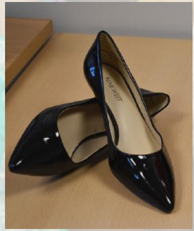
Black Patent Point Kitten Heels: Size 6