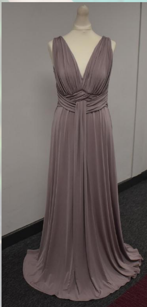
Long Ruched V-Neck Light Purple Dress Size 12