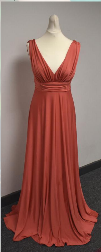
Coral V-Neck Ruched Dress (front) Size 8/10