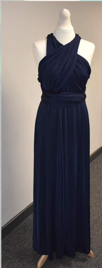
Navy Blue Multiway Dress (front) Size 18