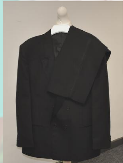
Black Two-Piece Suit Jacket: 44R Trousers (large)