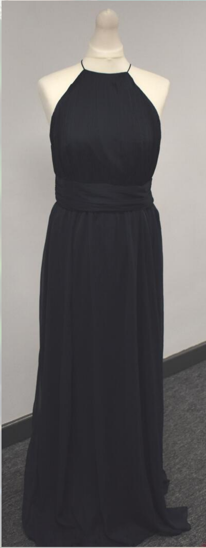
Long Navy Blue Halter-Neck Dress with Gathered Detail Size 10, 12 and 14 available