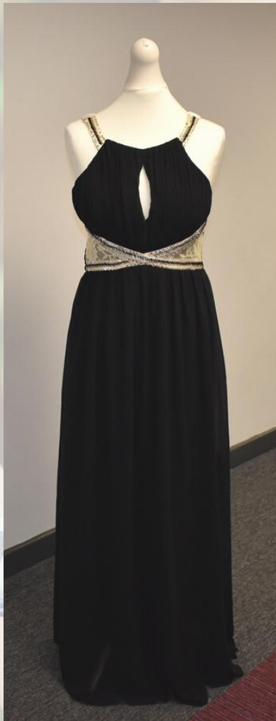
Black and Gold Chiffon Dress with Keyhole Front (front) Size 10