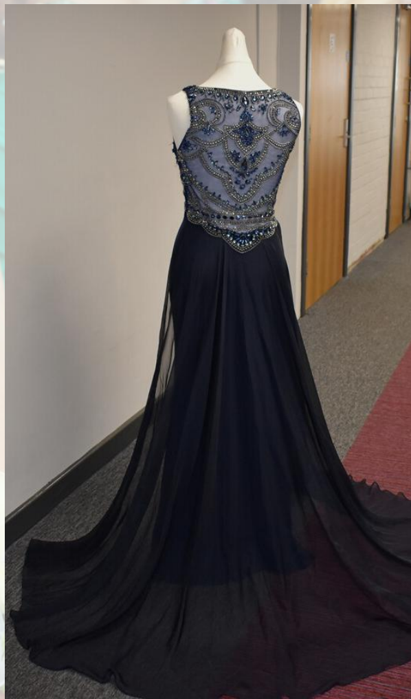
Navy Blue Embellished Dress with Train (back)