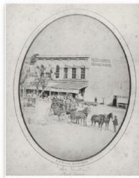
"Sam Houston" Mail Coach

PICA 26682, Austin History Center, Austin Public Library