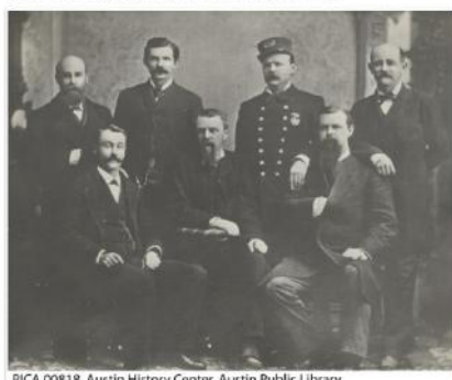
[Austin City Administration, 1881]

PICA 00818, Austin History Center, Austin Public Library