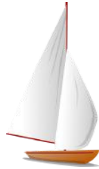
Boating & Sailing