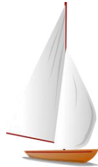
Boating & Sailing