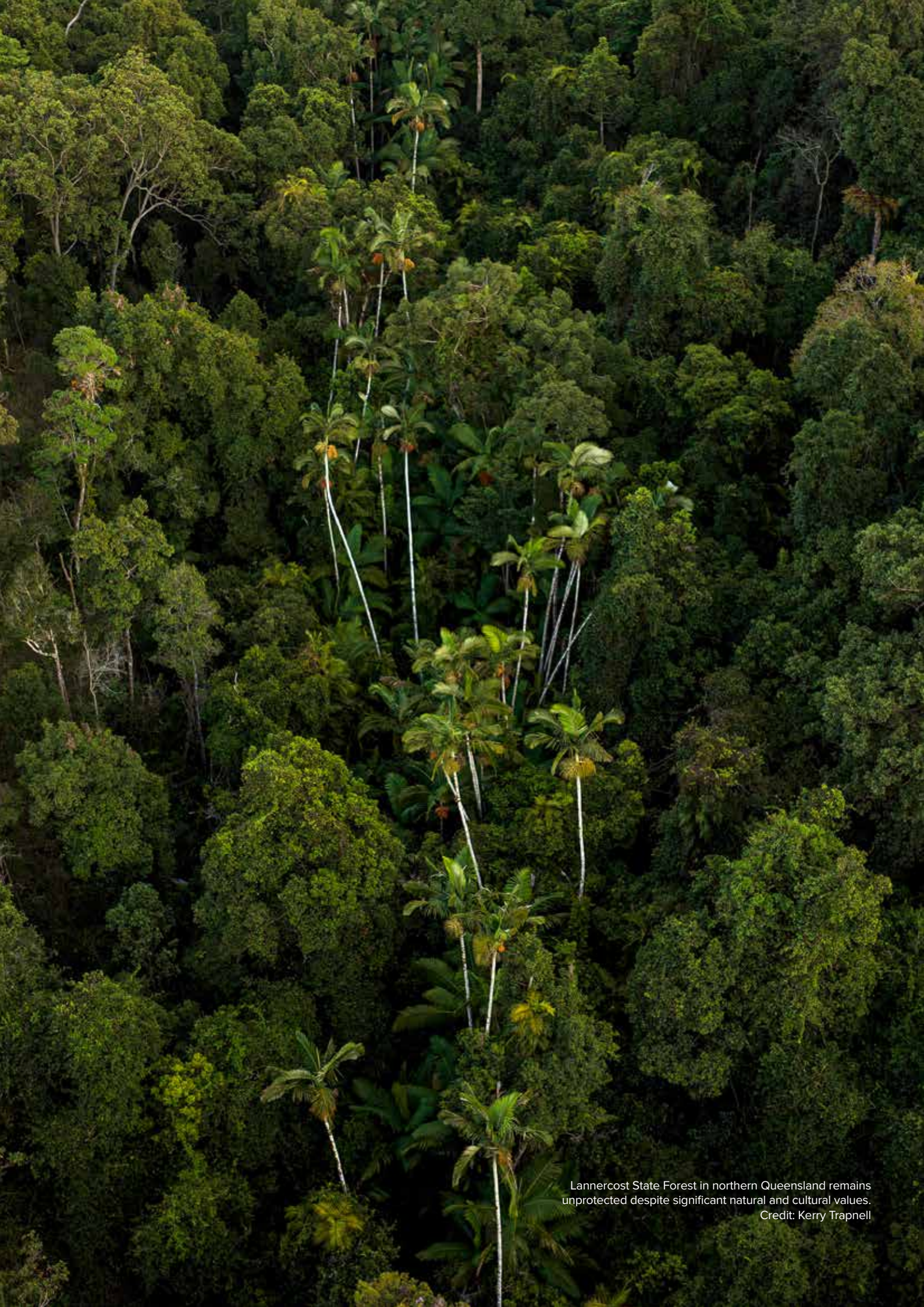
Lannercost State Forest in northern Queensland remains unprotected despite significant natural and cultural values.