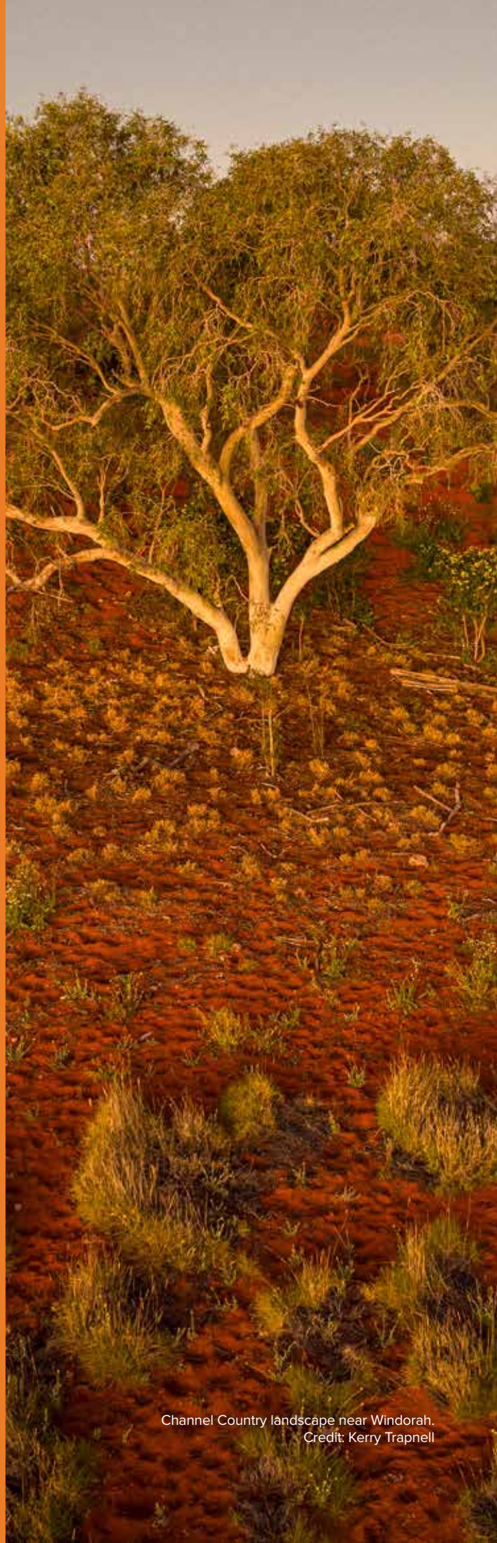
Channel Country landscape near Windorah.

To reach Queensland's protected area target of 17%, increase recreational and eco-tourism opportunities, and return land back to First Nations peoples, more investment is needed in protected area growth and management.