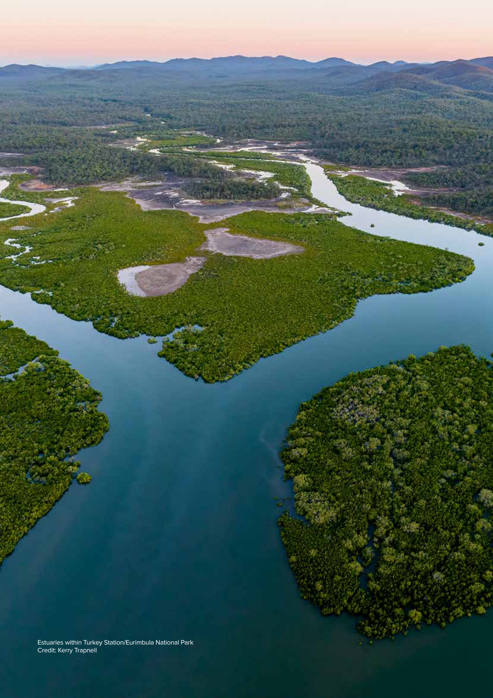
Estuaries within Turkey Station/Eurimbula National Park