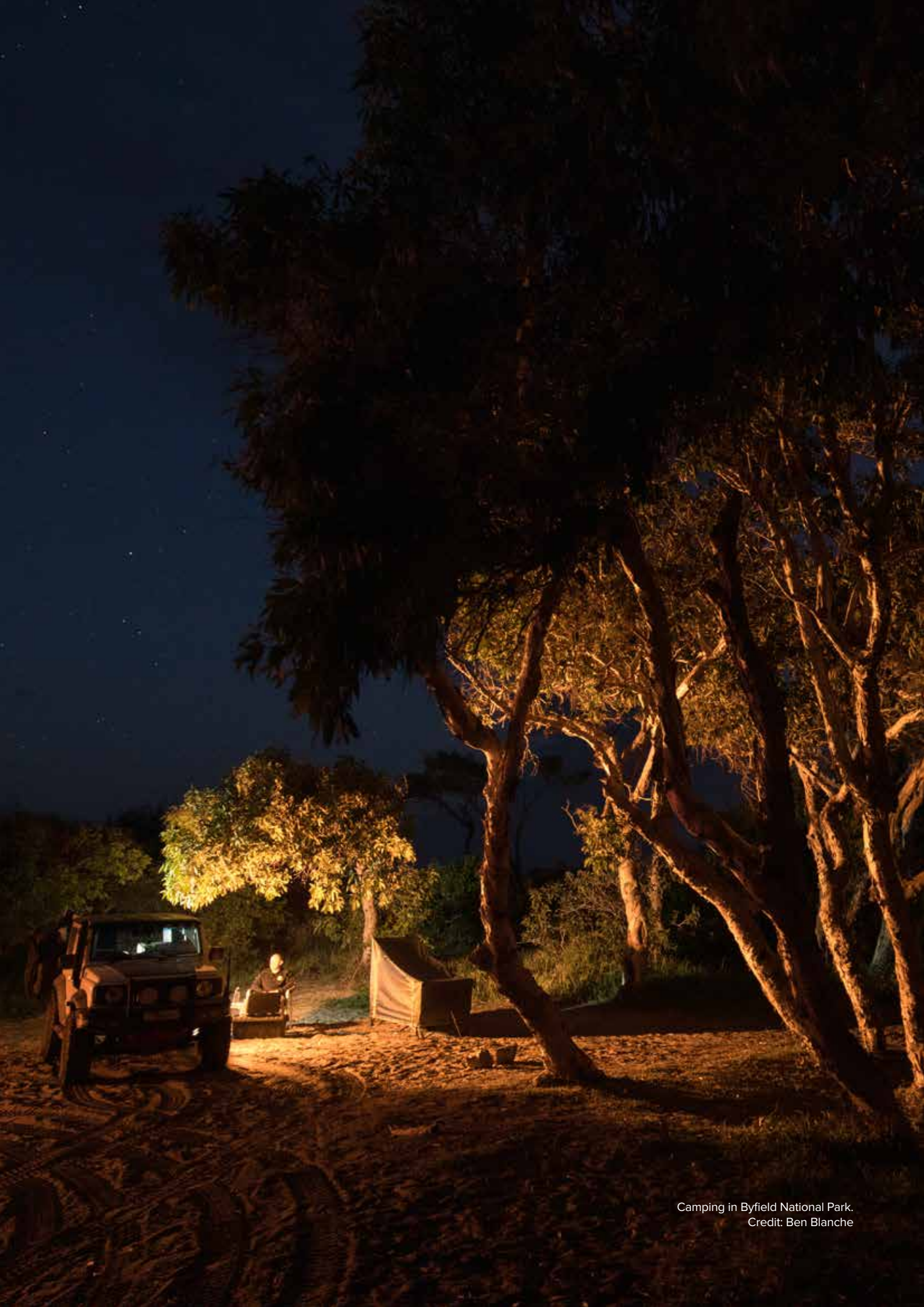
Camping in Byfield National Park.