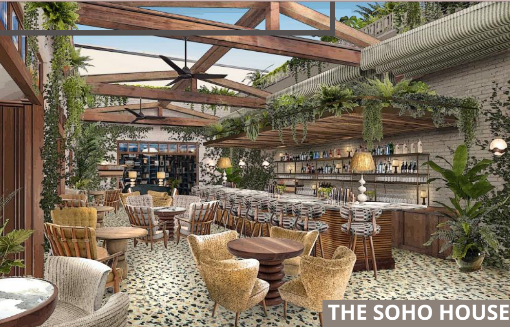
THE SOHO HOUSE