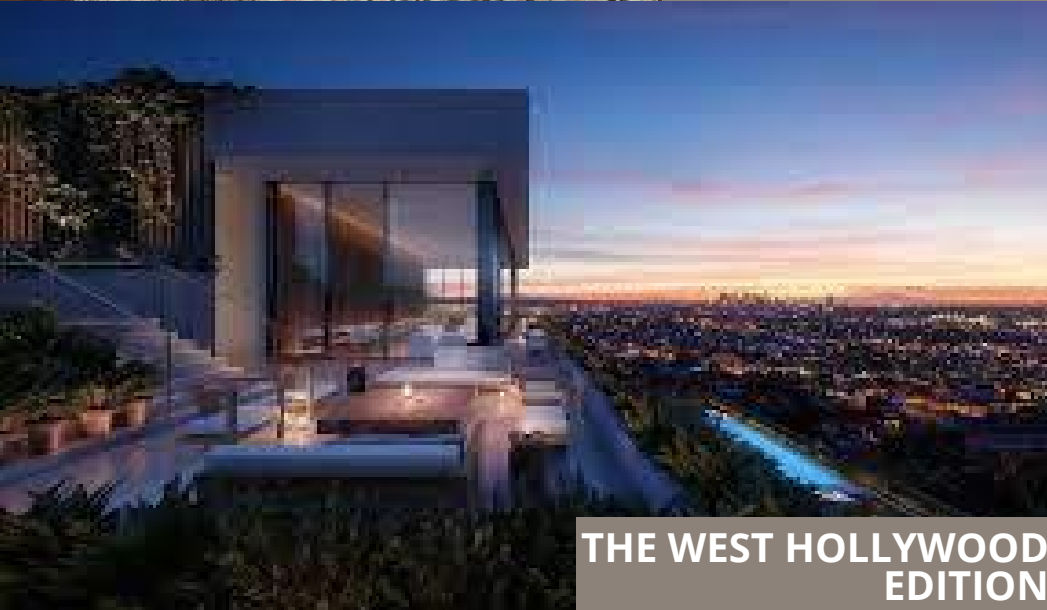
THE WEST HOLLYWOOD EDITION