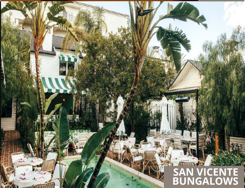
SAN VICENTE BUNGALOWS