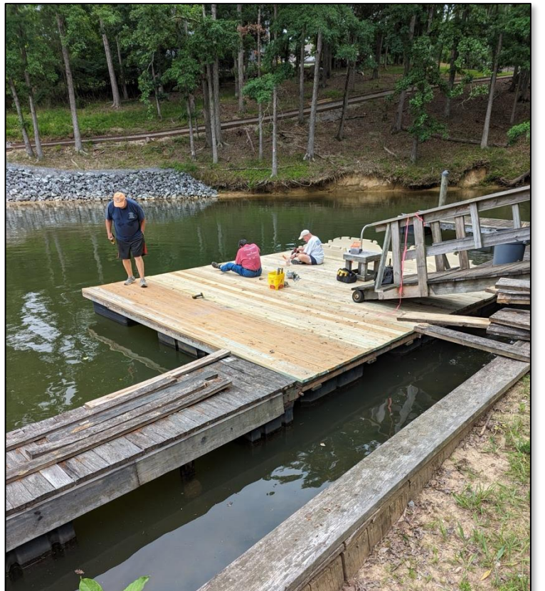
The new deck on the dock is complete. Now we need to re-cover the finger docks.