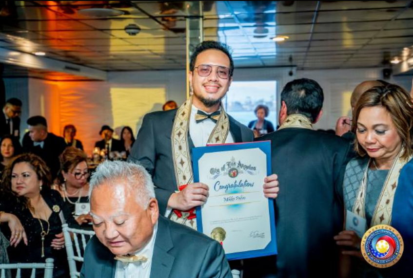
Certificate of Appreciation Los Angeles Mayor Eric Garcetti

Congratulatory Certificate from Los Angeles Mayor Eric Garcetti Los Angeles Mayor Eric Garcetti Mar 2022 "Congratulations on your election. May you be empowered to serve as Vice President of Events 2022-2023 of the Filipino American Chamber of Commerce of Greater L.A."