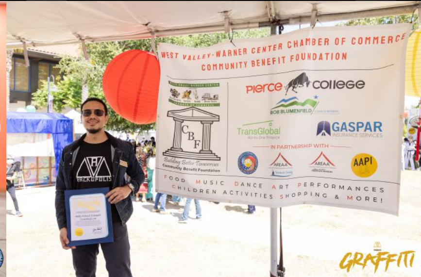
Exceptional Community Service Award Los Angeles Board of Public Works

Certificate of Recognition The California Legislature Assembly May 2022 In Recognition of Support for the 1st Valley Asian Cultural Festival and being a Community Leader, bringing cultural awareness and representation to the West San Fernando Valley