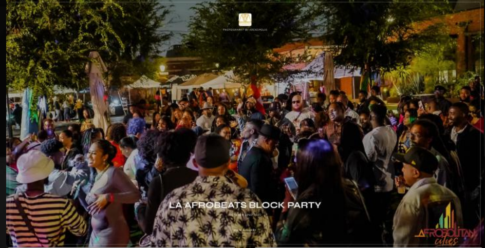
LIVE TV: KTLA CHANNEL 5