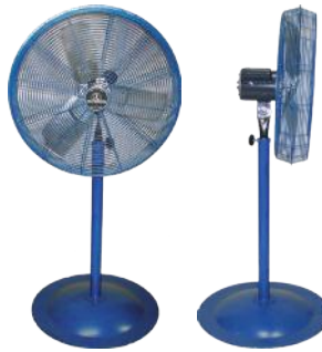
PB Pedestal Base Adjustable height: 42-72" 33" closed base