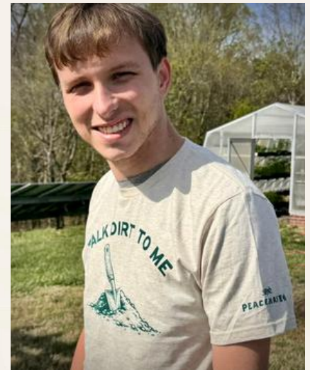
Leading in the RISE garden.