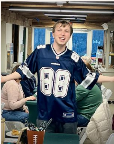
Musical Trivia, anyone?