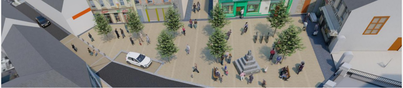
Athenry Public Realm Enhancements