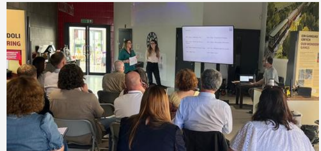
Consultation for Cei Llechi Caernarfon Green Space

We provide community consultation, stakeholder engagement, and online consultation hubs to ensure that projects are responsive to local needs and aspirations.