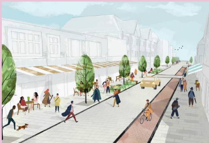
Horley High Street

Our designs create inclusive, lively towns and cities that foster a sense of community and promote sustainable growth.