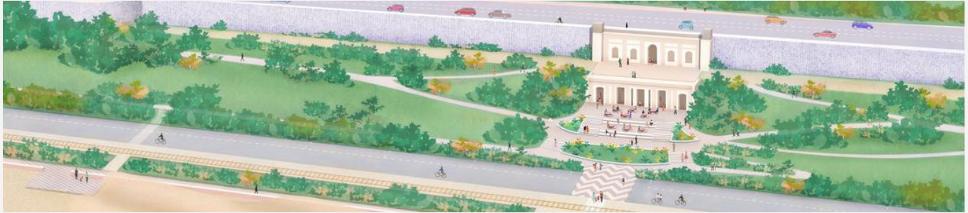
Black Rock Brighton