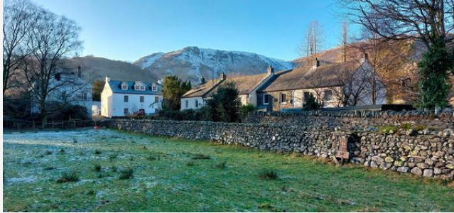
Lake District National Park Design Code