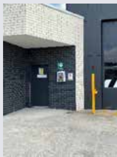
Ambulance Victoria 33 Willis Street