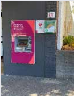
Bendigo Bank 11 Main Street