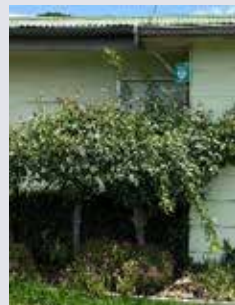
Winchelsea Golf Club 13 Anderson Street