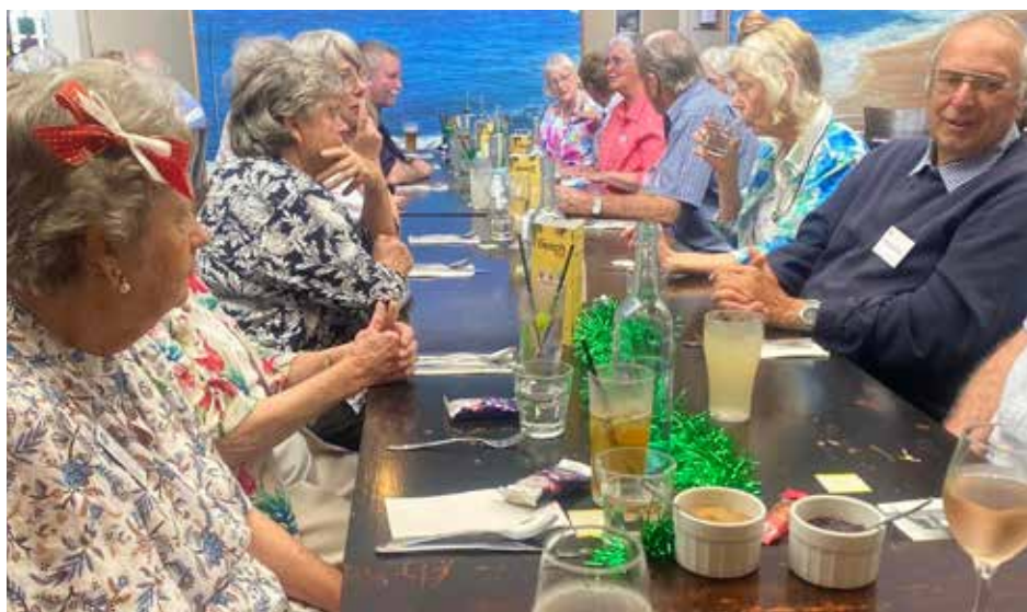
Enjoying Christmas lunch at Jan Juc Hotel

We try to cover a wide spectrum of topics from people's life stories, local identities, travel, first aid, local history, wedding dress collection, local mayor, policing, nursing, interesting collections, the list is endless.