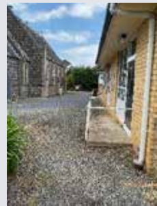
Uniting Church 33 Hesse Street