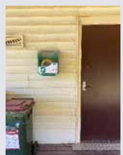
Wurdale Memorial Hall 220 Wurdale Road