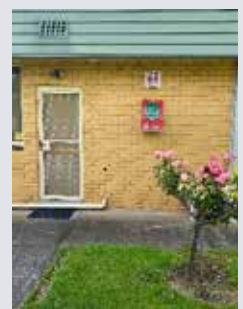
Senior Citizens 36 Harding Street