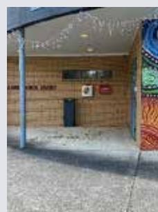
Hesse Rural Health 8 Gosney Street