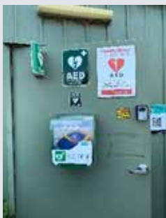
Men's Shed 51 Hesse Street