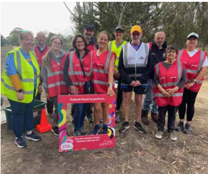
Volunteers from the Trebeck Reserve parkrun no 5

If you wish to join us any Saturday morning as a walker, runner or volunteer please complete the simple online registration at parkrun.com.au/register this only needs to be done once and can be used worldwide.