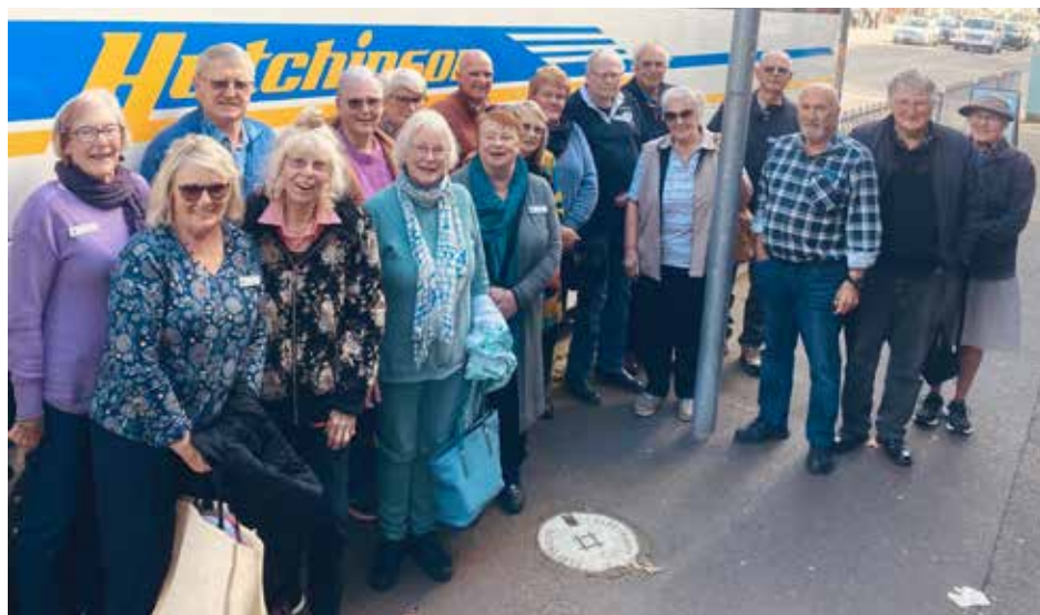
Group shot after visiting the Shrine and enjoying lunch