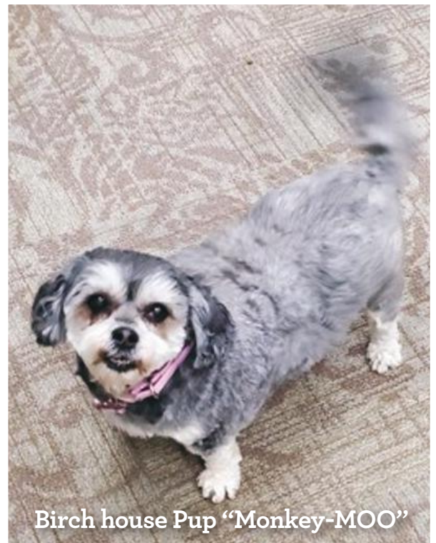
Birch house Pup "Monkey-MOO"

A smile is happiness you'll find right under your nose. ~ Tom Wilson