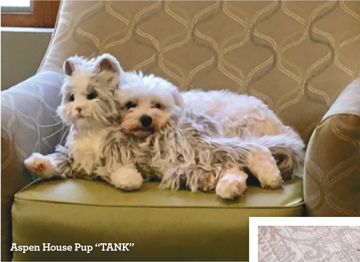
Aspen House Pup "TANK"