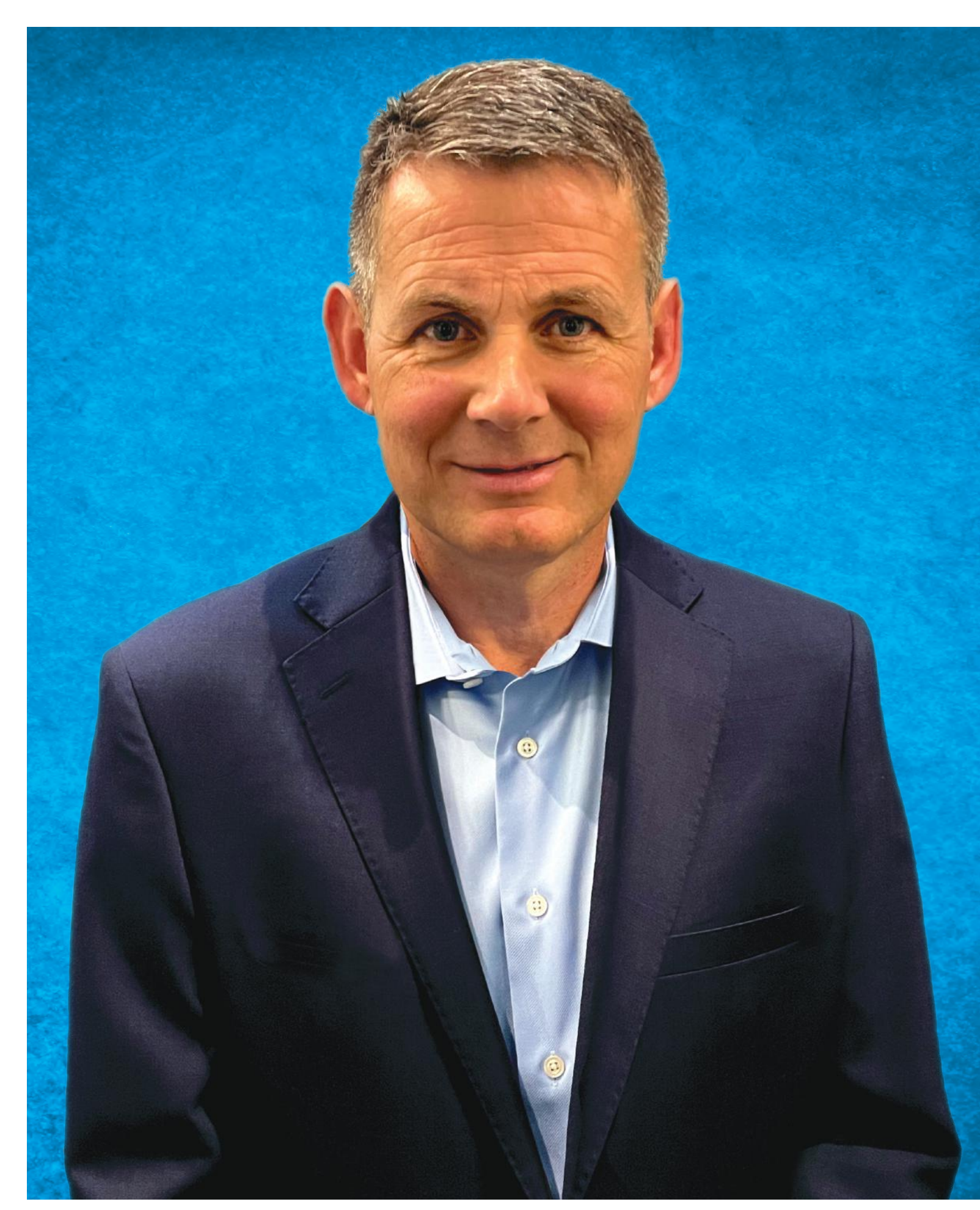
4 | Lakeland Senior Living