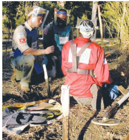
Left: Prince Harry learning demining techniques.

ordnance. At a celebration marking this achievement, Baroness Caroline Cox, a vice-speaker of the British House of Lords, offered praise for HALO's mission, and at a meeting with regional and local politicians, she characterized the demining effort as "humanitarian, rather than political." The HALO Trust in Nagorno Karabakh is currently funded by The United States Agency for International