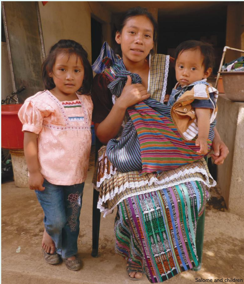
Salome and children