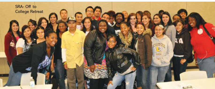
SRA- Off to College Retreat

For more information, visit: www.studentsrisingabove.org