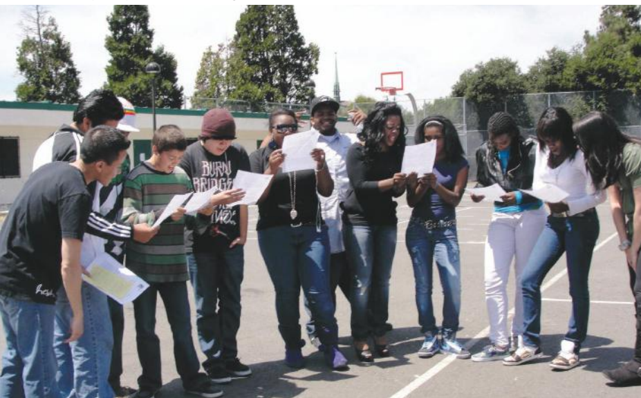
BAUDL participants read aloud together

For more information, visit www.baudl.org