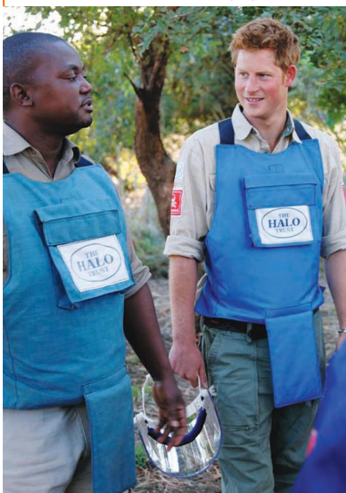
Prince Harry, right, with deminer.