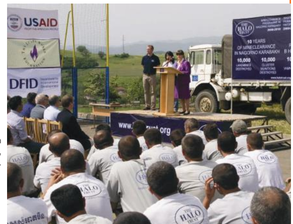
Baroness Cox speaking at the HALO 10th Anniversary event in Nagorno-Karabakh, with JBF logo displayed on the left.

For more information, please contact HALO USA toll free: 1 (877) HALOUSA or visit their website at www.HaloUsa.org