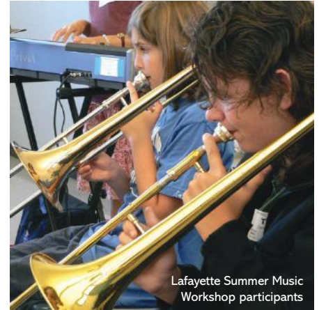
Lafayette Summer Music Workshop participants

For more information, visit www.GenerationsInJazz.org and www.stanleymusic.org