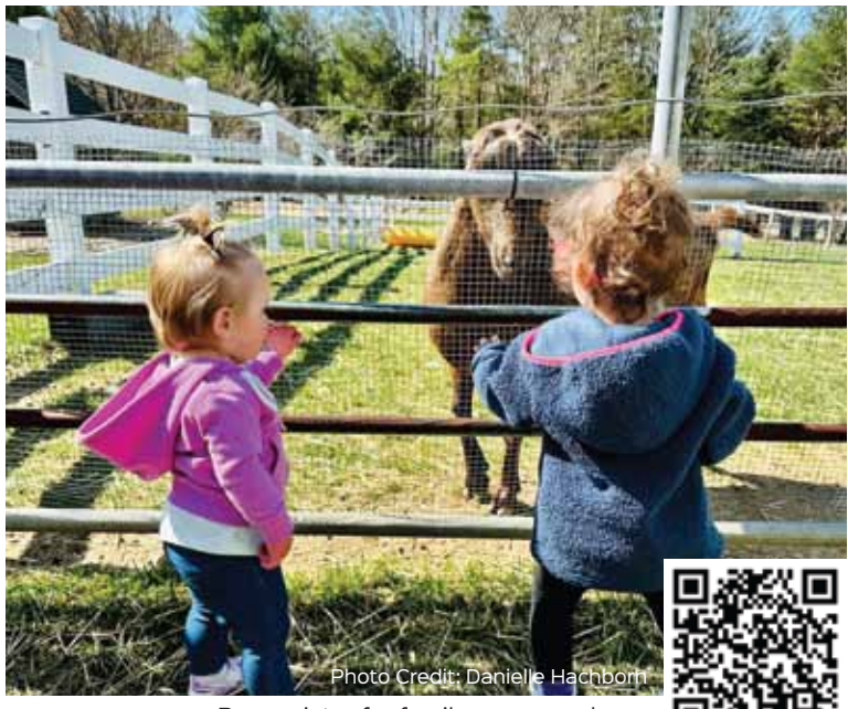
Pre-register for family programs here: