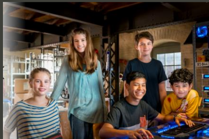
The cast of season 18.