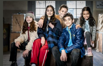
The cast of season 19 and 20.

The cast of "The Peppercorns" regularly changes to provide a dynamic and thrilling viewing experience . This strategy keeps the series engaging while continuously appealing to its target audience , thereby securing its longevity .