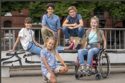
The cast of season 17.