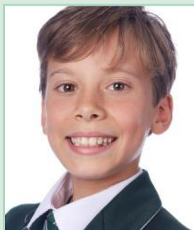
Barney Sports Ambassador

Across the School, the new academic year has started with a bang. Year 3 made an impressive debut playing their first-ever football matches against other schools. Each Key Stage 2 year group has participated in tournaments, including the Hampton Tournament for Years 5 and 6. The Year 6 A-team set a record by reaching the semi-finals of the Surrey Prep Schools Cup and will face Milbourne Lodge School on 25 November.