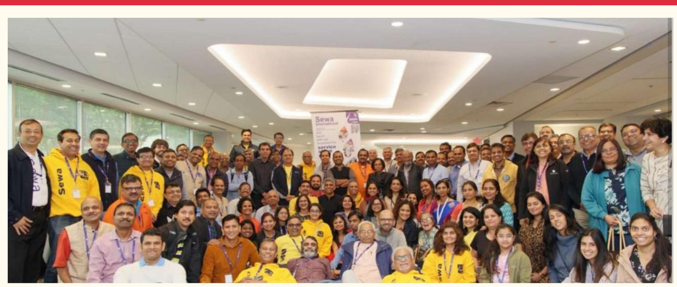
Participants at the Sewa's 16th national conference in Washington, DC in May 2022

Sewa International's 17th Annual National Conference will be held on May 6 and 7, 2023, in Atlanta. The Sewa Atlanta team has begun making arrangements for out-of-town visitors who will be staying with local hosts, and for airport pick-up and drop-off arrangements for the attendees.