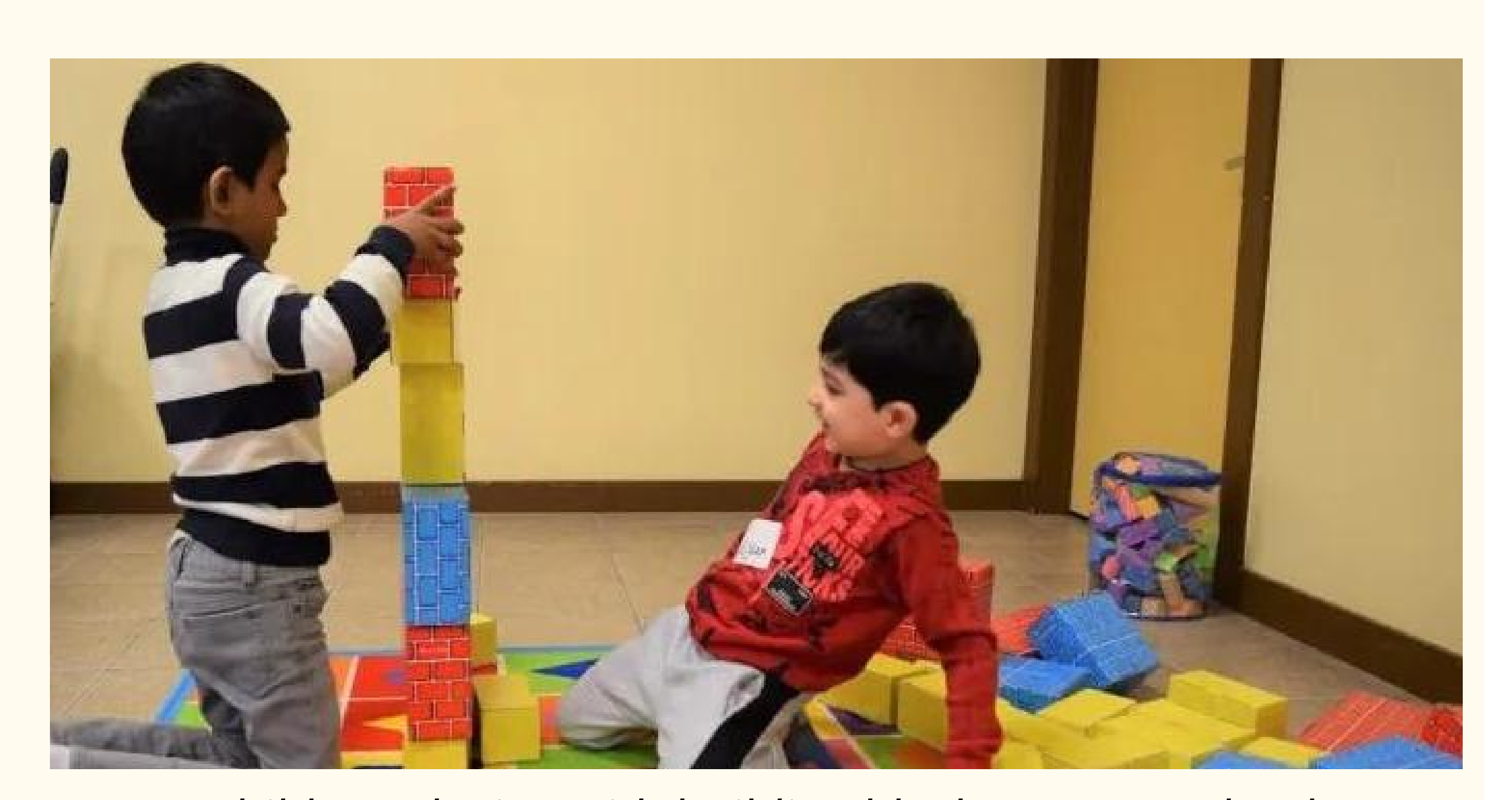
Children playing with building blocks at Aum school

Hindu Swayamsevak Sangh, Sewa International, Samskrit Bharati volunteers, and the San Antonio Hindu community took several weeks to prepare for the inauguration. Volunteers offered home-cooked prasad (offering to the deities) to devotees during the event. Volunteers from all three San Antonio temples played a part in conducting the school's inaugural rituals, which included vastu yajna, worship, a traditional meal preparation, and serving the attendees.