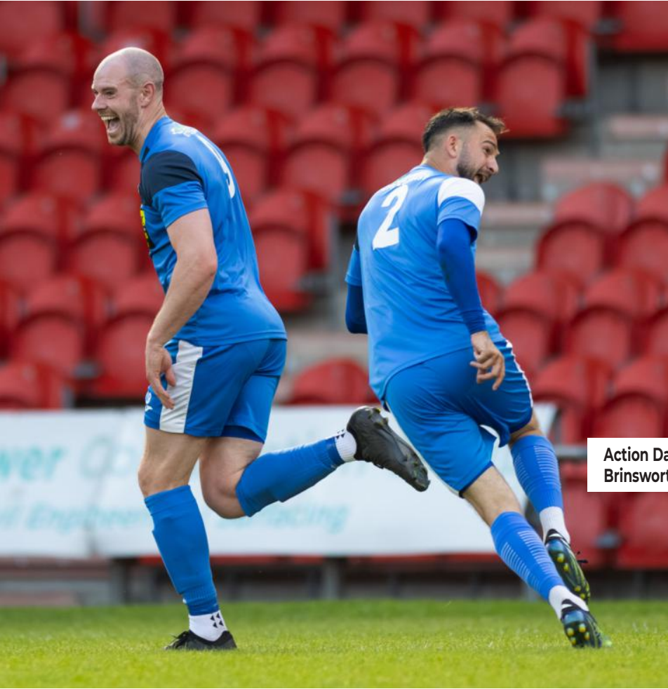
Action Darcy Cup: AFP Pewter Pot 2 -1 Brinsworth DC