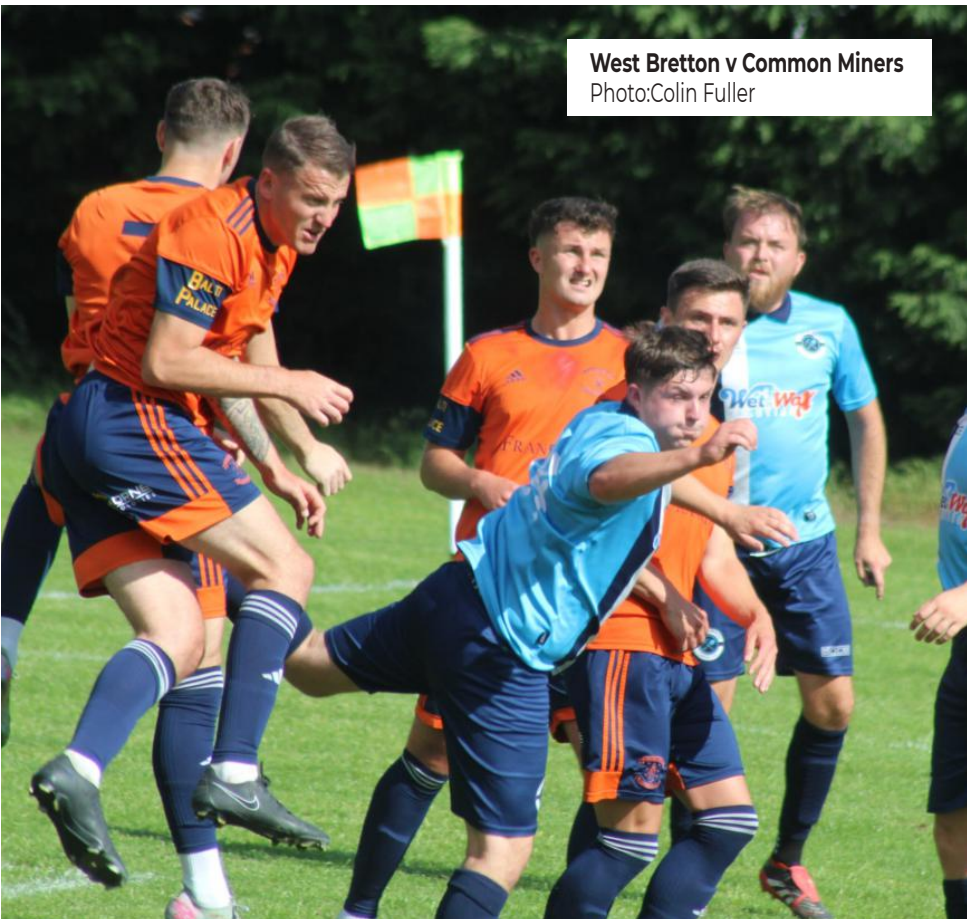
West Bretton v Common Miners