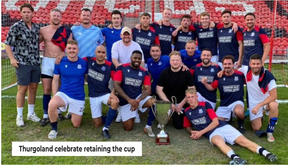
Thurgoland celebrate retaining the cup