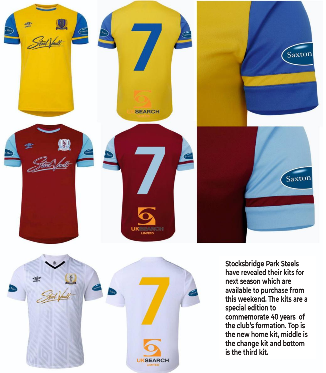
Stocksbridge Park Steels have revealed their kits for next season which are available to purchase from this weekend. The kits are a special edition to commemorate 40 years of the club's formation. Top is the new home kit, middle is the change kit and bottom is the third kit.