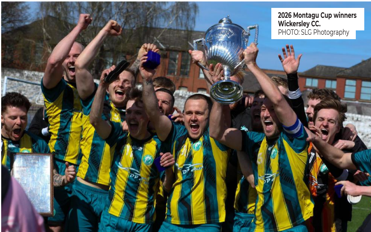
2026 Montagu Cup winners Wickersley CC.

W histon FC have become the first entrants for the 2026/27 Montagu Cup as preparations begin for the competition's 130th anniversary.