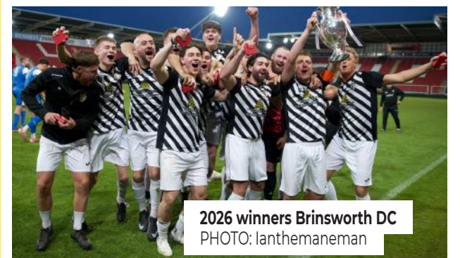
2026 winners Brinsworth DC

C lubs across the Rotherham area are being invited to enter the 2026/27 Charity Cup with organisers confirming key dates and competition details ahead of the new season.