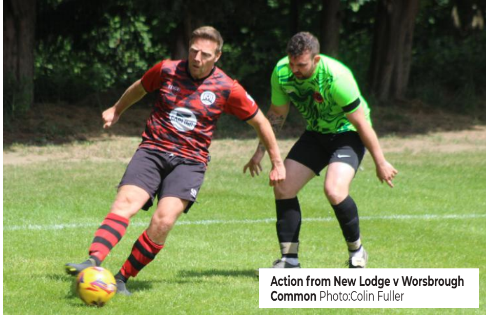
Action from New Lodge v Worsbrough Common