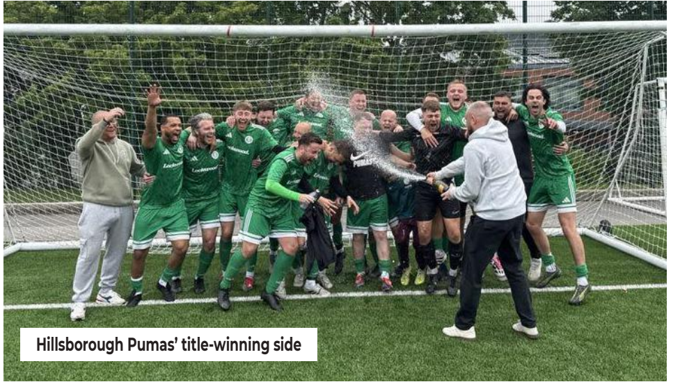
Hillsborough Pumas' title-winning side

T hurgoland retained the Sheffield & District Fair Play League Cup with a hard-fought 2-1 victory over Hammer & Pincers at Doncaster Rovers' stadium on Monday 25th May.