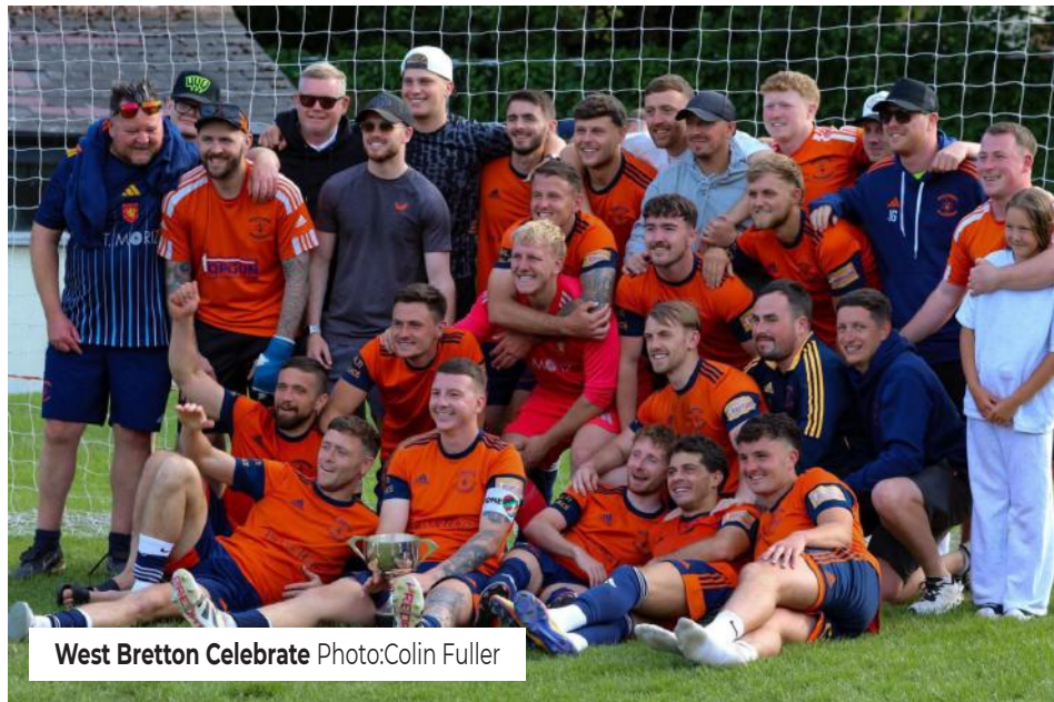
West Bretton Celebrate