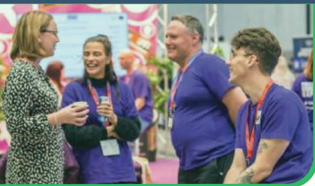
Exhibit the right way

The right audience and the perfect opportunity to shout about your business