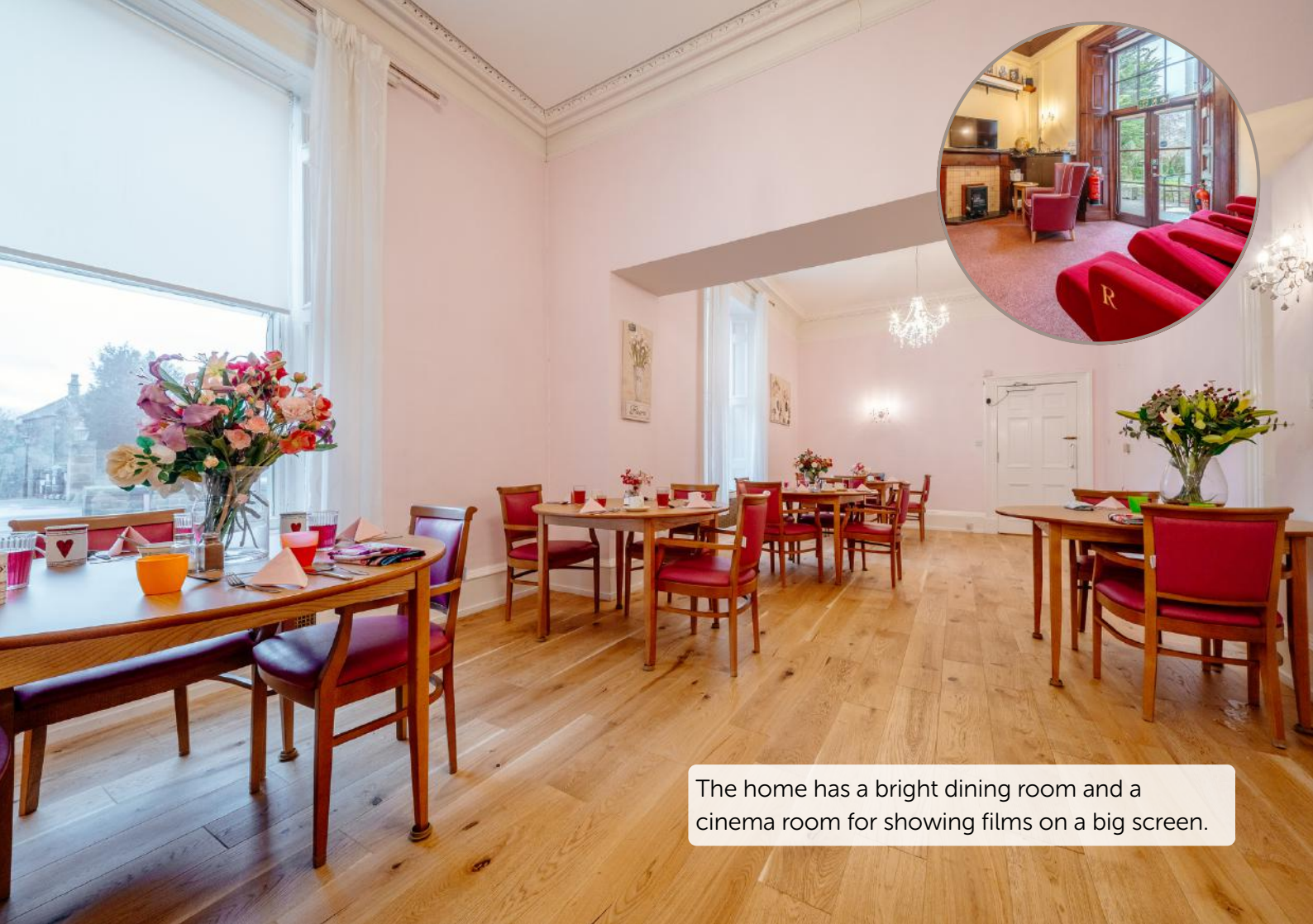
The home has a bright dining room and a cinema room for showing films on a big screen.