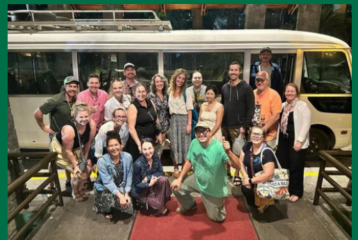
(top to bottom) Class 44 at Blanco y Negro, on the beach at Manuel Antonio, Siempre Verde Lodge, and getting off the bus on the last day of their travels