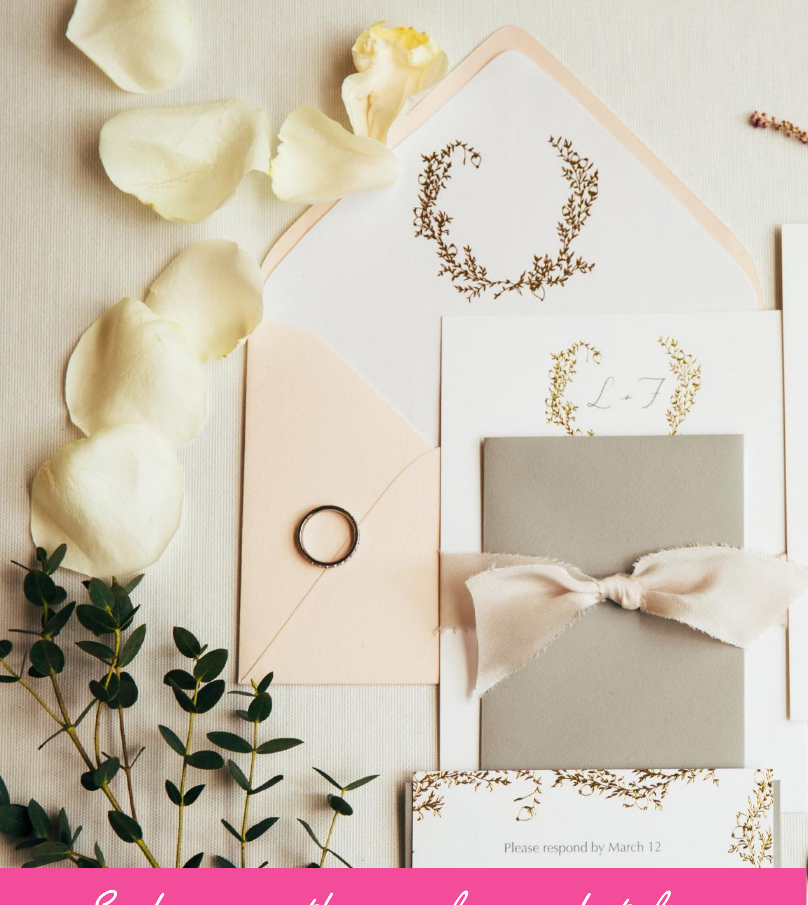
Send us your theme, colours and style and we will create your dream design!