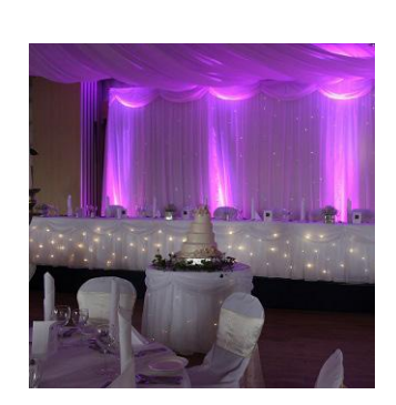
TOP TABLE SKIRT FROM £100

of black drape with built in fairylights.