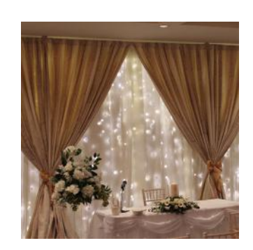
GOLD FAIRYLIGHT BACKDROP FROM £599

A beautiful backdrop for either your civil ceremony or behind your top table using Ivory fabric and fairylights.