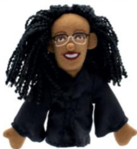
Ketanji Brown Jackson