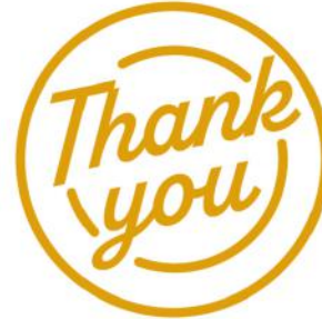
Dr. Henry “Hank” Jud Memorial Fund