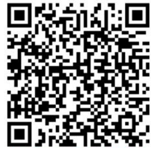
Juneteenth 2025 Program Here