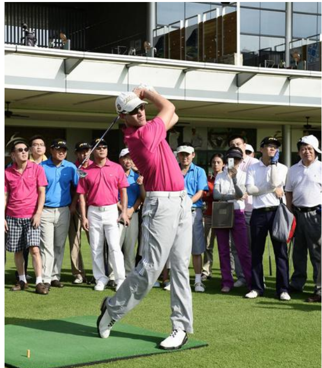
Teaching a golf clinic for China's largest bank in Sanya