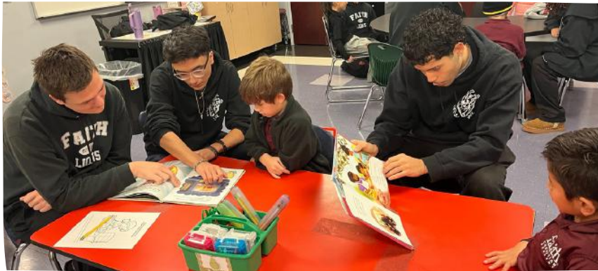
Seniors reading to Kindergartners

January marked a positive start to the semester as we settled back into the rhythm of campus life. The month featured Admission Preview Days, Spiritual Emphasis Week, and a meaningful baptism celebration as several students chose to take this important step in their faith. We also celebrated Literacy Week with our Adventure Awaits Book Fair, the 100th Day of School, a special Orlando Magic pre-game performance by our dance team, and gatherings for our homeschool families.