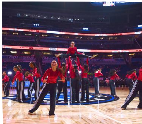
Integrity Dance Team at Orlando Magic Game