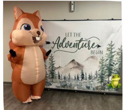
Book Adventure Awaits: Annual Book Fair