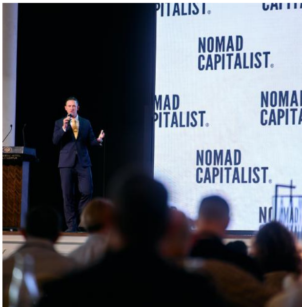
Giving a keynote speech in Kuala Lumpur, Malaysia

My biggest advice is simple: be yourself. I've built my platform by sharing real experiences, not by trying to be popular, cool, or like someone else. People are drawn to authenticity. When you're genuine, others can relate to you. Ironically, the more real and honest you are online, the more meaningful your impact will be.