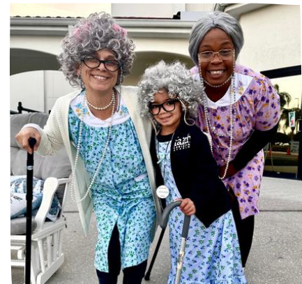
100 th Day celebration