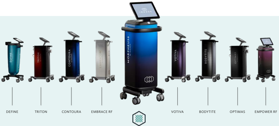
DEFINE TRITON CONTOURA EMBRACE RF MORPHEUS8 VOTIVA BODYTITE OPTIMA EMPOWER RF

InMode offers a variety of revolutionary non-invasive, minimally invasive, and invasive options and recently launched, a non-invasive hands-free facial and body contouring platforms: EvolveX and Define, working with radio frequency and EMS.