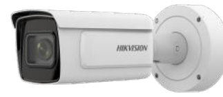
iDS-2CD7A46G0/P-IZHSY Dock Camera