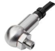
AE-MW6600 Fuel Level Sensor