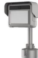
iDS-TCS402-B/CS/16 Speed Measurement Camera