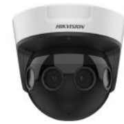
DS-2CD6944G0-IHS Panoramic Camera