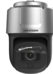
iDS-2VS445-F835H-MEY Illegal Parking Camera