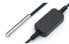
AE-MW6700 Temperature Sensor