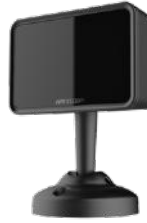
AE-VC154T-IT DBA (Driver Behavior Analysis) Camera