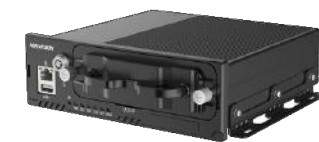
AE-MD5043 Mobile Video Recorder