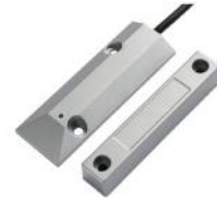
AE-MW6300 Door Status Sensor