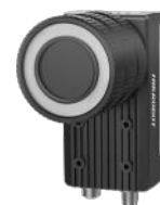
MV-ID6089M-00C-NNG Smart Code Reader