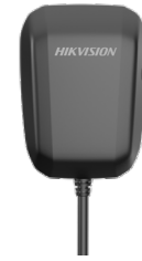
AE-VC155T ADAS (Advanced Driver Assistance System) Camera