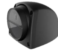
AE-VC224T-IT BSD (Blind Spot Detection) Camera