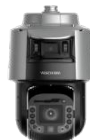
DS-2SF8C442MXS-DLW(14F1) TandemVu Camera