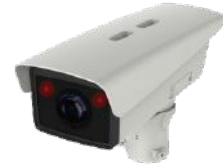
DS-TCG405-E ANPR Camera