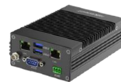
MV-VB2210-120G Vision Box