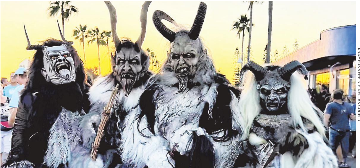
KRAMPUS VEREIN PINELLAS COUNTY

If you caught sight of a Krampus (or four) around South Pinellas, that most likely was the Krampus Verein Pinellas County.