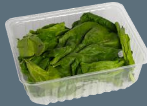
CEREAL BOXES AND OTHER HOUSEHOLD ITEMS