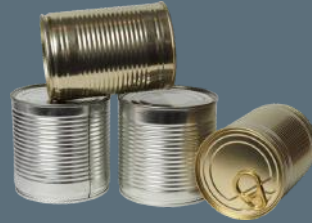
ALUMINUM AND TIN CANS