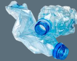
PLASTIC BOTTLES AND JUGS #1-#5 AND #7