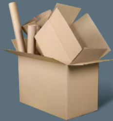
BROKEN DOWN CARDBOARD BOXES