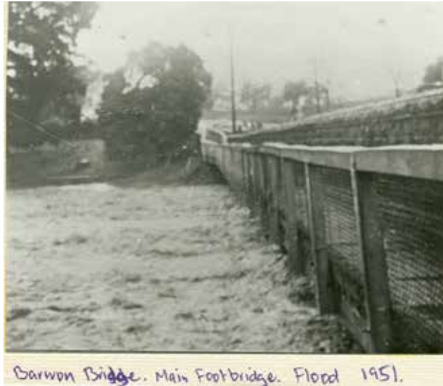
Barwon Bridge. Main Footbridge. Flood 1951.

In 1852 the Barwon Bridge - which had stood the storms and floods of many years- stood a great deluge.