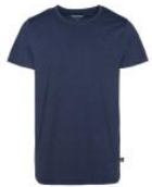
Navy Melange TSMB230