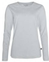
Grey Melange LSWB92