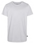
Grey Melange TSMB92