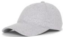
Grey Melange BCB92