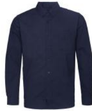
Solid Navy SUB68