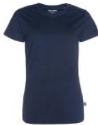
Solid Navy TSWB68