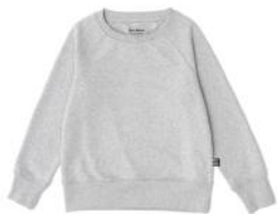
Grey Melange KDSW92