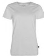
Grey Melange TSWB92