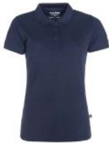
Solid Navy PQW68