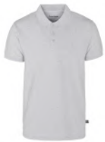
Grey Melange PQM92