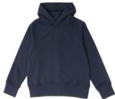
Solid Navy KDHD68