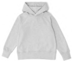
Grey Melange KDHD92