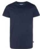
Solid Navy TSMB68