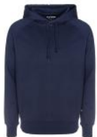
Solid Navy HDUB68