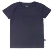
Solid Navy KDTS68