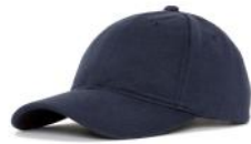
Solid Navy BCB68