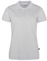
Grey Melange PQW92