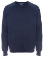
Solid Navy SWUB68