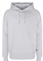
Grey Melange HDUB92