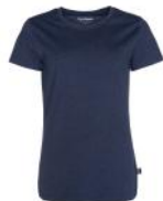
Navy Melange TSWB230