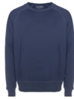
Navy Melange SWUB230