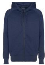
Navy Melange HJUB230