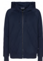
Solid Navy HJUB68