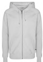
Grey Melange HJUB92