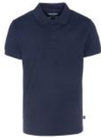
Solid Navy PQM68