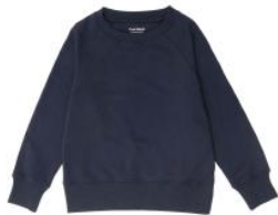
Solid Navy KDSW68