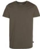
Khaki Green TSMB77