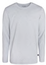
Grey Melange LSMB92