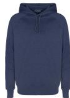
Navy Melange HDUB230