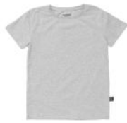
Grey Melange KDTS92