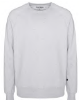
Grey Melange SWUB92