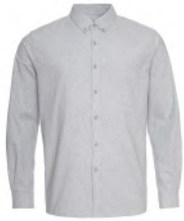
Grey Melange SUB92