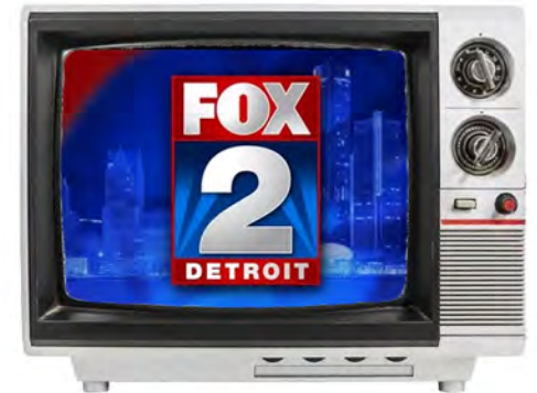
November 2023 SDM2 Collaboration