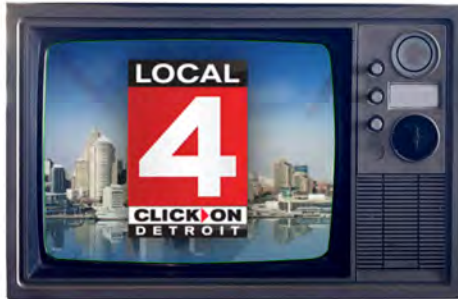
July 2023 Moosejaw Meal Kit Event