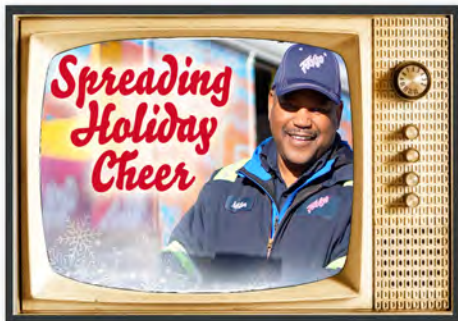
December 2023 Faygo Holiday Commercial