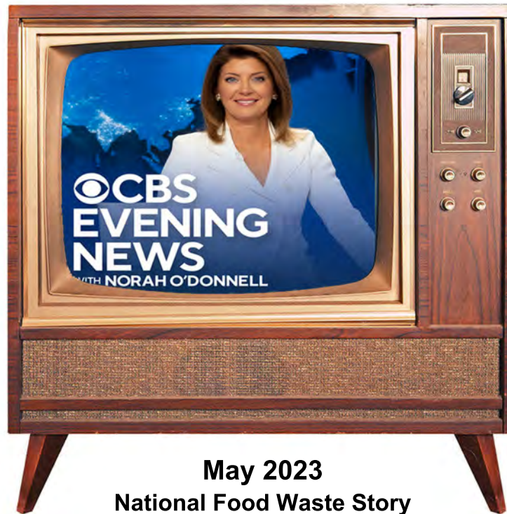
May 2023 National Food Waste Story