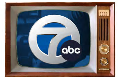
March 2023 Vibe Truck Sponsor Event