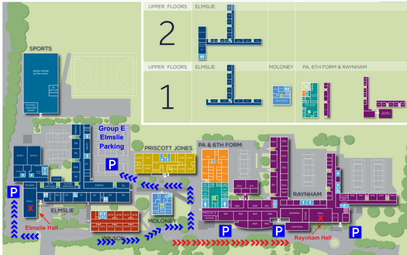
Group E - Elmslie Parking