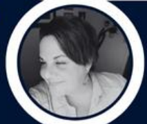
Facilitated by Kelly Jones

Let's broaden understanding and learn about local, practical strategies to make a difference in our community.