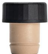
Duo BT Synth