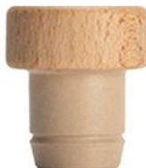
Duo BT Wood