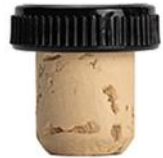
Standard BT Cork