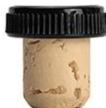
Standard BT Cork