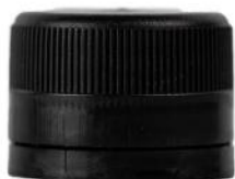
Secure 31 Insert