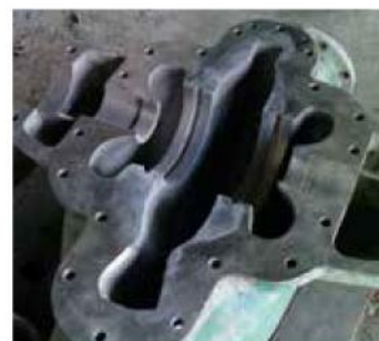
Bonding and shimming