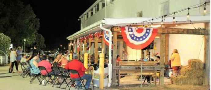
Fair karaoke every night on the patio ... come join in the fun