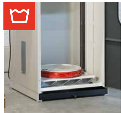
Collector tray for residual liquid