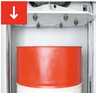
Press ram with spikes