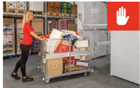
Convenient and quick loading