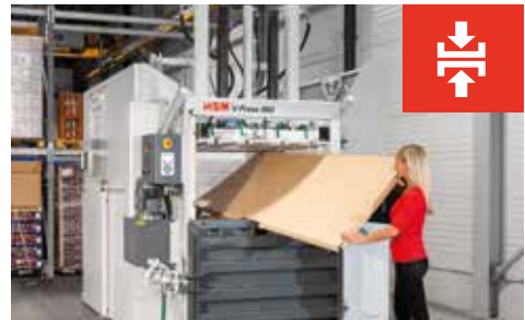
Compresses bulky cardboard with no problem