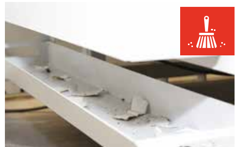
Easy to clean