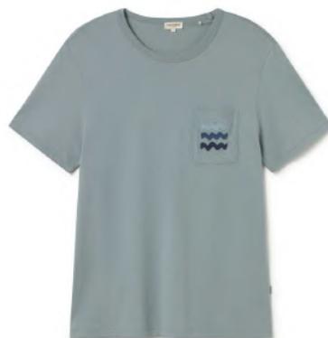
● Dunmoran - Lead Sea