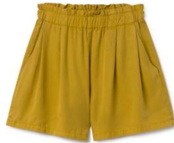
● Calobra - Mustard 100% TENCEL™ Lyocell