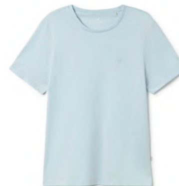
● The Organic Cotton Tee - Light Blue