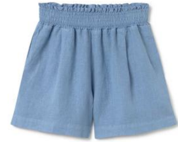
● Walfisch - Denim Blue 100% light linen