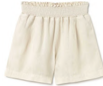
● Walfisch - Sand Stone 100% light linen

Wide leg & high waist Lightweight - 125g Falls above the knee Breathable & soft fabric Temperature regulating properties Elasticated waist Side pockets