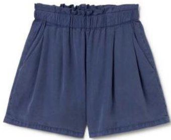
● Calobra - Blueberry 100% TENCEL™ Lyocell

Wide leg cut Fall above the knee Eco-responsible viscose Breathable & soft fabric Elasticated waist Side pockets