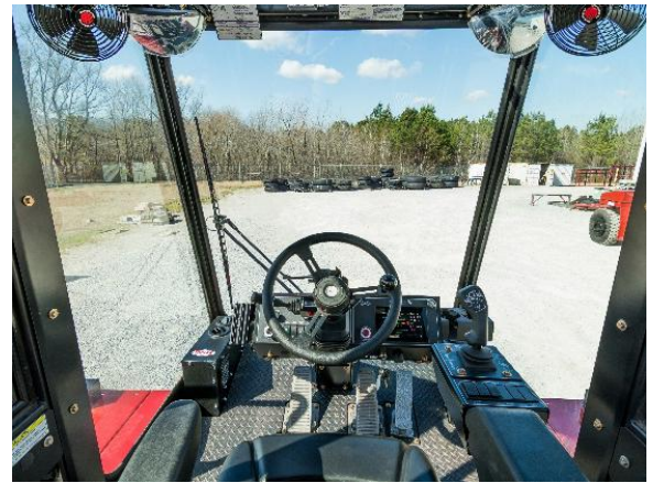
Climate Controlled 2-door Cab - All Steel - Heat, A/C & Defrost (Standard)