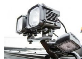
12 LED Work /Step Lights (Standard)