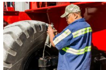
Easy Access for Steer Axle Maintenance