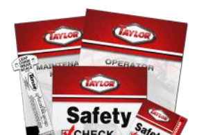
Vehicle Information Package (Standard)