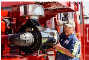
Donaldson Air Cleaner with Safety Element (Standard)