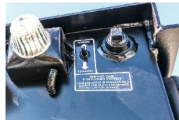
Service Cab Positioning Switch allows the Cab to be Traversed with Machine Powered Down