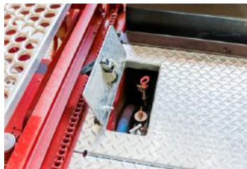
Daily Checks are Easily Accessed from the Operator Platform without Deck Lid Removal