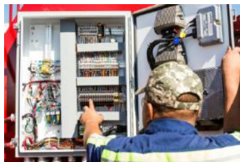
Easy Access to Heavy Duty Circuit Breaker Panel and Breaker Reset Switches