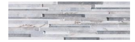
Ess. Denali Gris