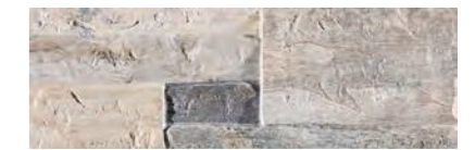
Ess. Shasta Ocre