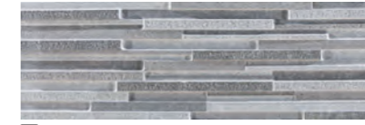
Ess. Denali Antracita