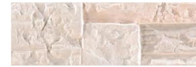
Ess. Shasta Arena