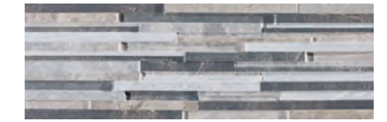
Ess. Denali Mix