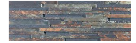
Ess. Denali Magma