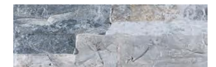
Ess. Shasta Grafito