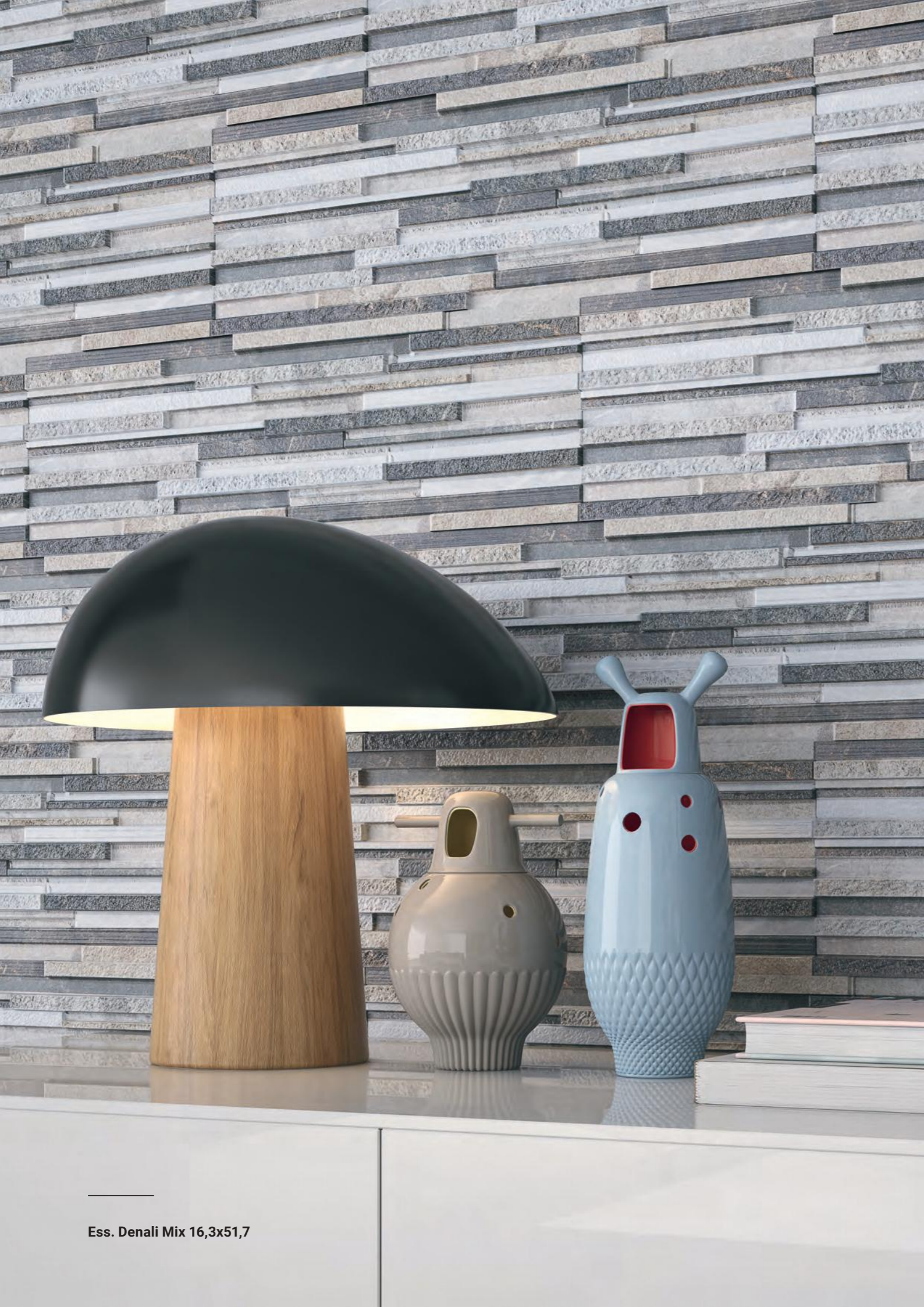
Ess. Denali Mix 16,3x51,7