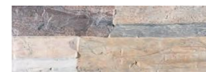
Ess. Shasta Terra