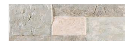
Ess. Shasta Gris