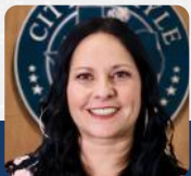
Mayor Yvonne Flores-Cale