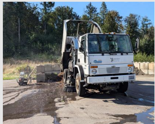
The SRA street sweeper being cleaned.