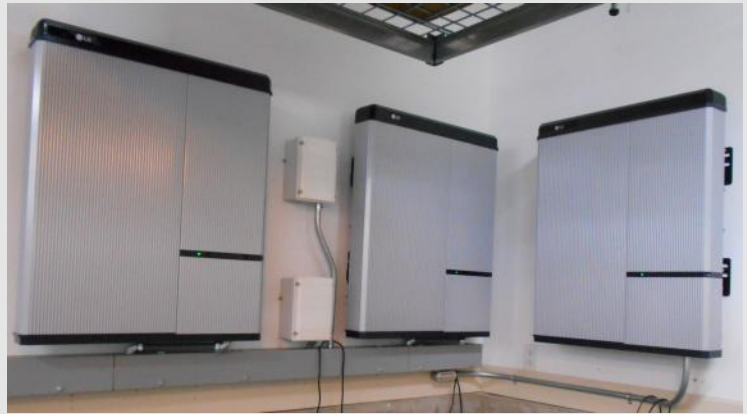
Solar power batteries in his Semi-ahmoo home.

We installed solar panels on our roof in October, 2019. We're fortunate that we have a lot of roof area that's unshaded by trees and faces south and east. When the panels were installed, we also had storage batteries installed; these batteries collect excess electricity from the solar panels and store them in large batteries, usually installed in your garage, and the batteries stay charged until they are used for home power. They act like a generator when the power goes out, but don't require fuel, starting them up, or venting to keep you safe from dangerous fumes. They are connected to a separate circuit breaker panel, and the consumer decides what should be powered. Depending on the number of batteries you have, you can count on sufficient stored and collected power to keep your refrigerator and freezer operating, to power an electrical outlet in every room, to power your internet gateway, necessary medical devices and other lower power consumption devices that you need.