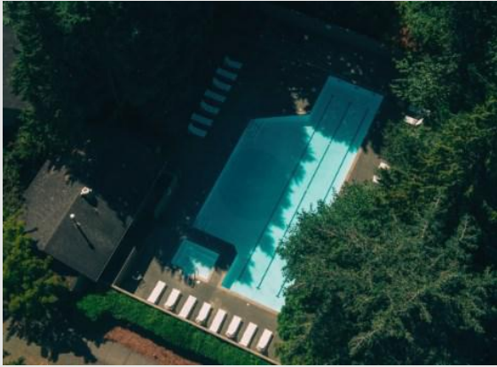
Swimming pool at the Golf Course

Goodbye to Summer —The Semiahmoo Golf Course’s pool will close for the summer for the season on Monday, September 2, 2024. The Golf Course’s practice facilities and Great Blue Heron will be closed on Monday and Tuesday, September 9 and 10 for the yearly aerification of the course.