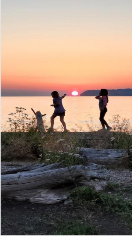
Photos of children playing at sunset at the Semiahmoo Spit beach this summer

For consideration of using some of your visual community memories in the newsletter, submit to elisa@srahoa.com or to a member of the Communications Committee. Tell us where you were when you took them.