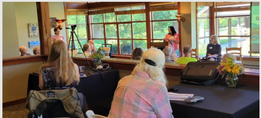
The Budget Town Hall was Saturday, August 17 at the golf course's Palmer Room at the Great Blue Heron Restaurant.