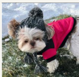
Dolly "I'd Rather Be In Florida"