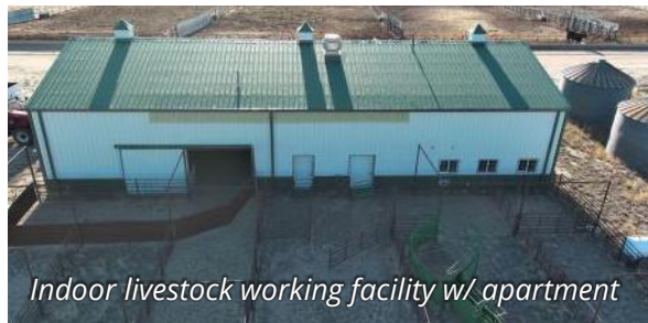
Indoor livestock working facility w/ apartment