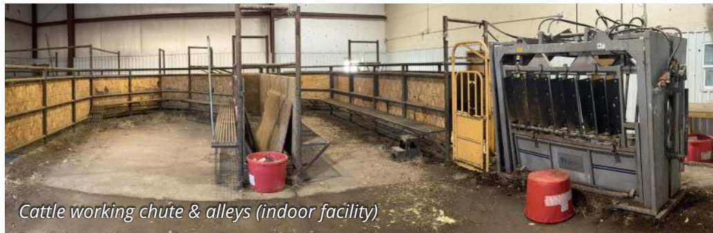
Cattle working chute & alleys (indoor facility)