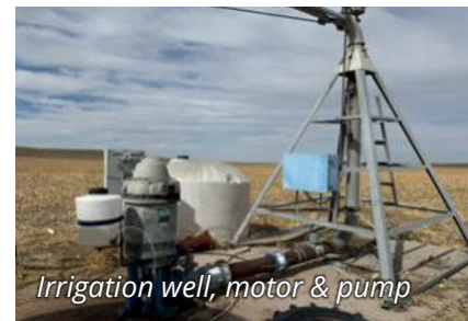
Irrigation well, motor & pump