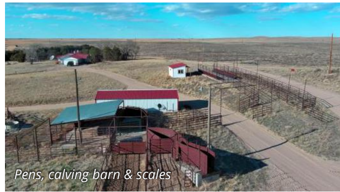
Pens, calving barn & scales

The Otto E. Lueking Jr. Estate is liquidating the assets of the estate and offering this exceptional local ranch for sale (formerly known as the Shiner Ranch). 4,018.1± total acres consists of 3,229.4± acres grass/improvements, 640.0± acres state lease pasture, and 148.7± acres with 9-tower pivot. Well-planned improvements include calving barn, indoor livestock working facility with apartment, multiple homes, steel pipe pens, small feedlot, and more. Possession upon closing, to be negotiated based on the time of year the property sells.