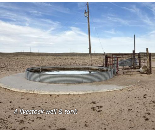
A livestock well & tank