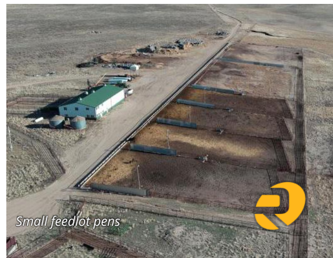
Small feedlot pens