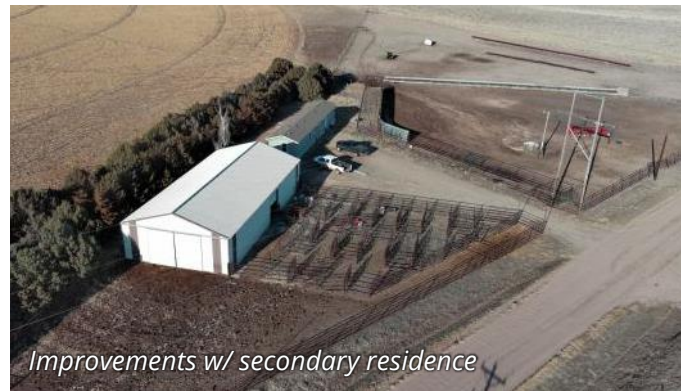
Improvements w/ secondary residence