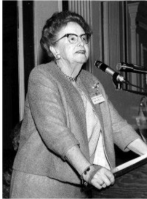
Ethel Percy Andrus speaking at an NRTA/AARP convention

Dr. Ethel Percy Andrus (September 21, 1884 – July 13, 1967) For all of her success in building two national organizations, Ethel Percy Andrus' most important achievement was in changing America's image of retirement. "As it is," Dr. Andrus observed in 1958, "when you leave a job, they often just give you a gold