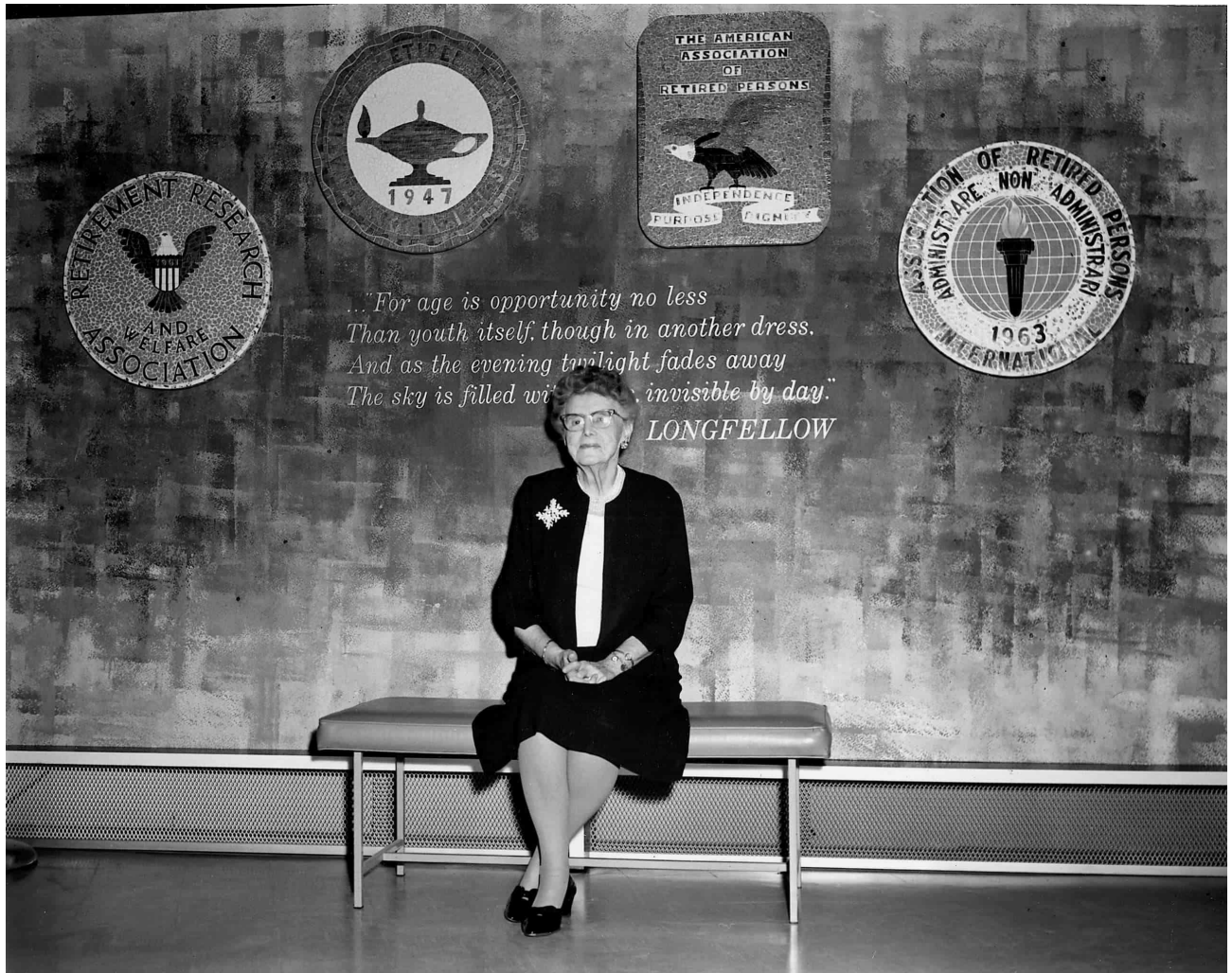
Ethel Percy Andrus at AARP's Dynamic Maturity Pavilion, New York World's Fair, 1964

Dr. Ethel Percy Andrus (September 21, 1884 – July 13, 1967)