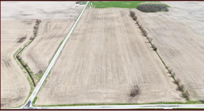
30+/- Acres 29.69+/- Tillable | 0.31+/- Other