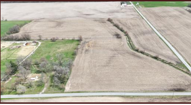
30+/- Acres 28.11+/- Tillable | 1.89+/- Other