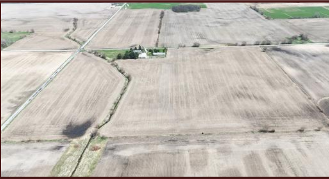
44+/- Acres All Tillable